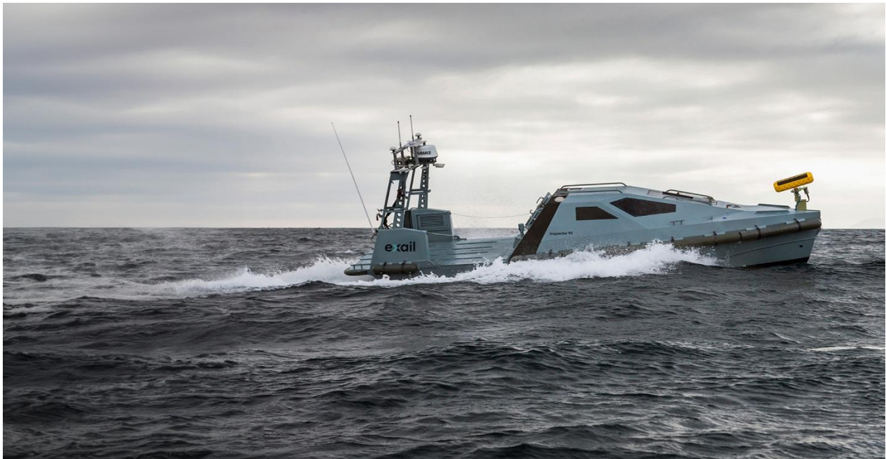
Inspector 90 surface drone

In parallel with the REPMUS exercises, Exail is participating in the European I-SEAMORE exercises at the same location. The I-SEAMORE project aims to improve maritime surveillance through enhanced surveillance capabilities using autonomous solutions. Exail is participating in this project with its Inspector 90 surface drone, equipped with advanced optronic sensors for surface detection.