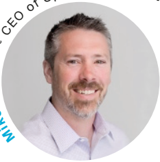
Mike Shehan - CEO of SpotX

On 2 November 2015, SpotX and ad-tech start-up Clypd announced the development of a single solution for media owners to manage the sale of all forms of TV assets and video inventory. The pairing of SpotX's digital video platform and Clypd's linear TV platform will create ad sales solutions that empower media companies to holistically monetise audiences and video across all distribution points. SpotX and Clypd are part of the RTL Digital Hub which was launched in June 2015 to bundle RTL Group's recent investments in the online video market.