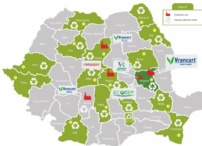
Figure 2. Locations

The object of activity of Vrancart SA consists in the production and marketing of the following products: