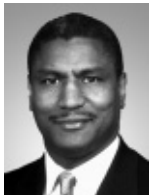
RODNEY E. SLATER

Mr. Seidenberg has served as a director of Verizon since 1997 and was a director of NYNEX Corporation from 1991 to 1997. Mr. Seidenberg is also a director of BlackRock, Inc. (since January 2011). In the past five years, he has also served as a director of Honeywell International Inc. and Wyeth.