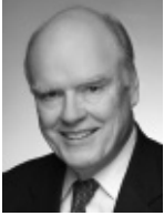
JOHN W. SNOW

Dr. Snow, 71, is President of JWS Associates, LLC, a consulting firm. He was the U.S. Secretary of the Treasury from February 2003 to June 2006. In that position, Dr. Snow was responsible for managing the finances of the U.S. Government, promoting economic growth and ensuring the safety and soundness of the U.S. and international financial systems. Prior to his appointment as Secretary of the Treasury, from 1989 to 2002, Dr. Snow was the Chairman and Chief Executive Officer of CSX Corporation, which operated the largest rail network in the eastern United States and provided intermodal transportation, domestic container shipping and international marine terminal services. As of December 31, 2002, CSX Corporation had over $8 billion in annual operating revenues, $20 billion in assets and approximately 40,000 employees. He currently serves as the non-executive Chairman of Cerberus Capital Management, L.P., a private investment fund.