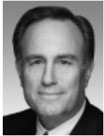
IVAN G. SEIDENBERG

Mr. Seidenberg, 64, is Chairman and Chief Executive Officer of Verizon Communications Inc. Mr. Seidenberg has led Verizon since its inception, first as co-Chief Executive Officer in 2000, then as sole Chief Executive Officer since 2002 and as Chairman since 2004. Mr. Seidenberg began his career over 40 years ago with a predecessor of Verizon, holding positions of increasing responsibility, including serving as Chairman and Chief Executive Officer of NYNEX Corporation, then Bell Atlantic Corporation, both predecessors of Verizon. Mr. Seidenberg was instrumental in forming Verizon through a number of mergers and acquisitions, including Bell Atlantic and NYNEX (1997), GTE Corporation (2000) and MCI, Inc. (2006). He also helped create what is now Verizon Wireless in 1999 by bringing together the assets of Bell Atlantic Mobile, GTE Wireless and the U.S. properties of Vodafone AirTouch.