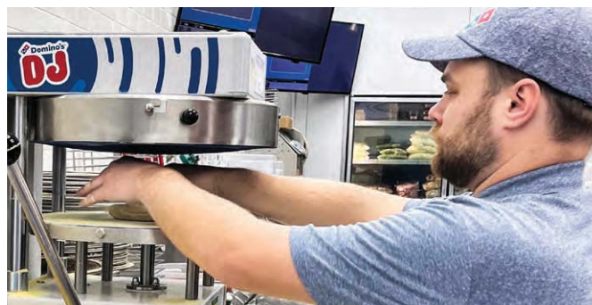
Domino's 'DJ' dough stretching machines are having an impact on product consistency and speed to competency for new team members.

Additionally, we also made significant progress in deploying 1,600 'DJ' dough stretchers (appropriately named DJ, for the way it 'spins' dough) across our U.S. system – more than a 50% increase from where we were at the end of Q3. All these investments ensure that every Domino's customer receives a consistent, high-quality experience. They also make the job easier for current team members and speed up the time to competency for new employees. I want to thank our franchisees and our operations team for their continued efforts to achieve Operational Excellence. This is a point of pride and differentiation for Domino's.