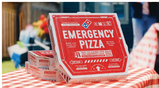
Emergency Pizza was back in 2024 in more places than ever.

We leaned into consumer tensions and created talk value in our national promotions. At a time where consumers are feeling they are getting less and paying more – our MORE-flation campaign showed them Domino's was in their corner – giving them more for less. Another area where we broke through the clutter in 2024 was around the growing pressure to tip, even when no extra service is provided. We decided to flip the script by tipping customers back through our You Tip, We Tip promotion. Finally, we brought our Emergency Pizza campaign back, but in more places than ever. We partnered with Amazon's Twitch, Netflix's Squid Games, NFL star Stefon Diggs, and the beauty brand Olive & June to bring Emergency Pizza to consumers in fun and unexpected ways.