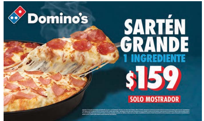
Mexico and our other international markets successfully leaned into Renowned Value in their promotions.

Despite geopolitical challenges and economic pressures, our international franchisees have shown remarkable resilience and have enormous potential for growth. By focusing on driving our Hungry for MORE strategy, we expect to create sales momentum that will produce the same kind of market share gains and net store growth we have achieved in the past.