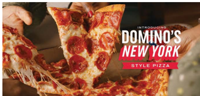
Domino's launched New York Style Pizza, reflecting our commitment to having the Most Delicious Food.

New York Style Pizza added a popular crust option to our menu, while Mac & Cheese reinvigorated our existing pasta platform. As we head into 2025, we will continue to build on this momentum by focusing on making our innovation more ownable and memorable through the launch of at least two new products – which is our annual goal.