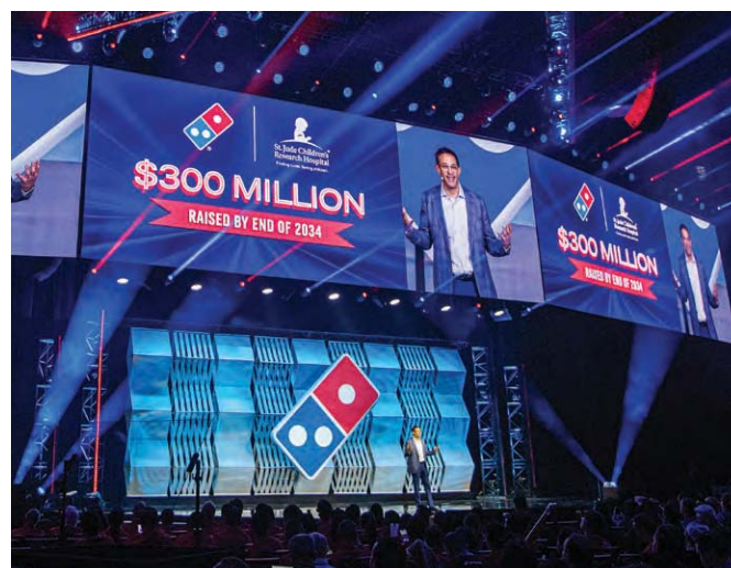
Domino's committed to raising $300 million for St. Jude Children's Research Hospital, the largest commitment to a children's hospital ever made.

In the U.S., St. Jude Children's Research Hospital™ is our national charity partner, and for 20 years we have supported this lifesaving organization, raising over $143 million in customer donations since 2004, and joining them in their mission to find cures and save children around the world. At Rally this year, I announced Domino's commitment to raising $300 million for St. Jude by 2034 . No brand has ever made a commitment like this to a children's hospital, and I am proud to say that in 2024 we raised $18 million, already exceeding our annual target on the road to a cumulative $300 million.