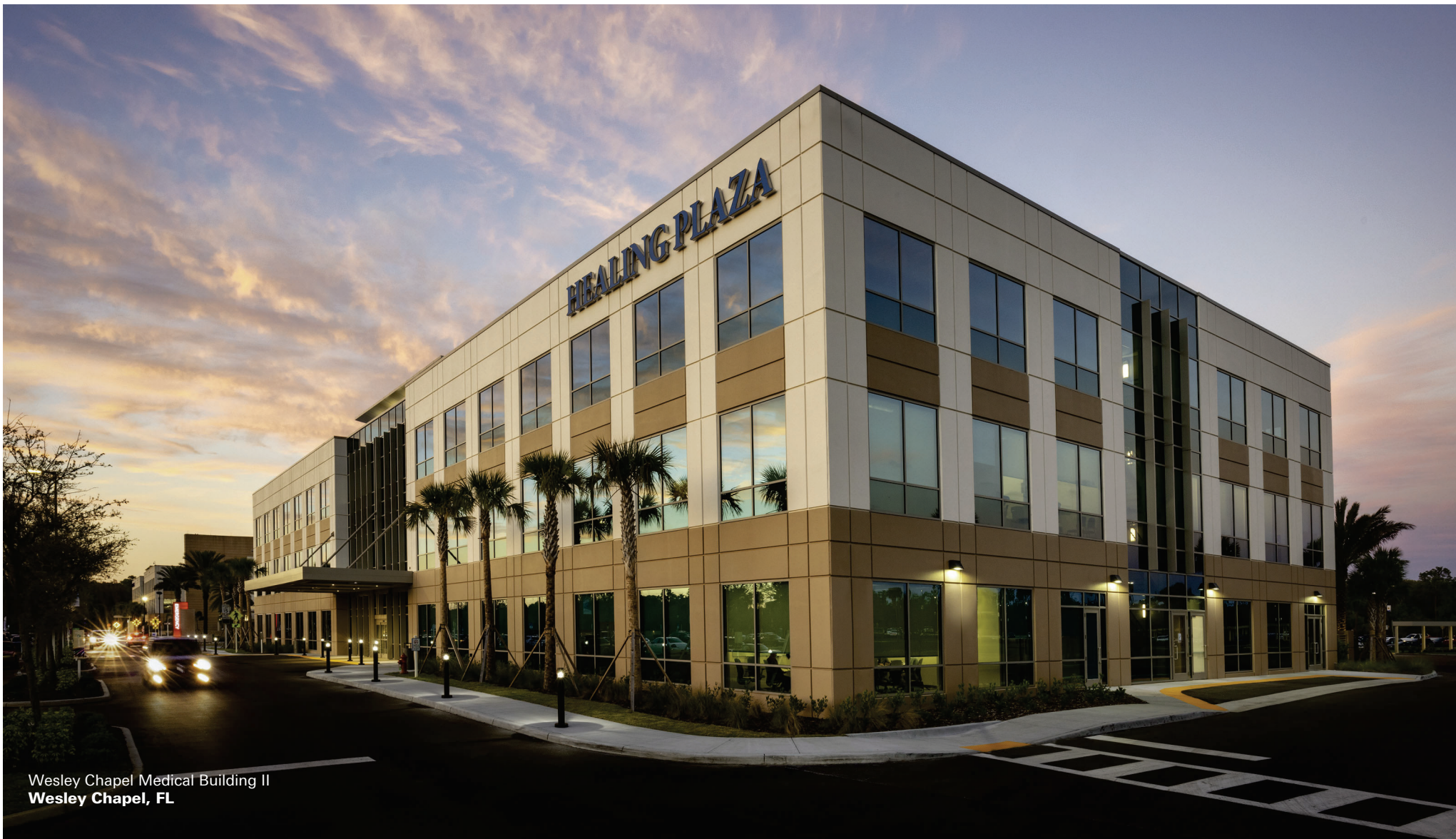
Wesley Chapel Medical Building II Wesley Chapel, FL