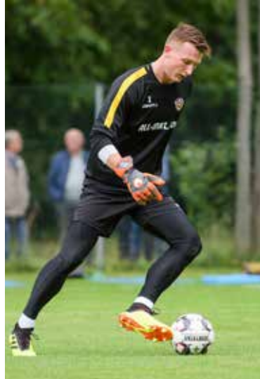
Dynamo Dresden in collaboration with Craft Teamwear.