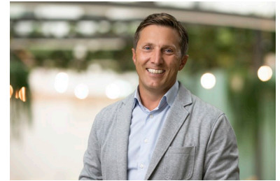
Fredrik Ruben CEO, Tobii Dynavox

Our strong performance throughout 2023 continues, characterized by a substantial growth in sales and a more than doubled operating profit in the closing quarter of the year. As previously, growth was solid across all geographical areas and user groups. To realize our long-term growth potential, we are committed to investing in new staff, skills and tools to boost the scalability of the business. The low level of awareness regarding communication aids among prescribers and potential users presents an enormous opportunity for us to make a meaningful difference, while also significantly growing our business.