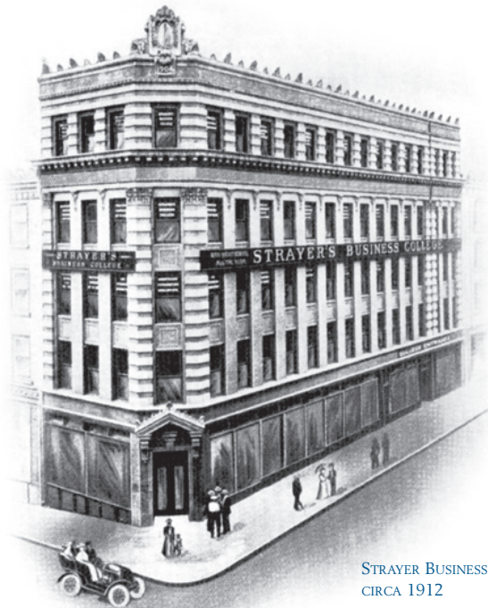
STRAYER BUSINESS COLLEGE CIRCA 1912

Finally, in presenting this catalog, we want to thank a discerning public for its support, and assure it that we shall endeavor to continue to merit the bountiful confidence it has heretofore placed in us.