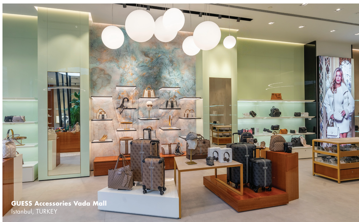
GUESS Accessories Vada Mall Istanbul, TURKEY