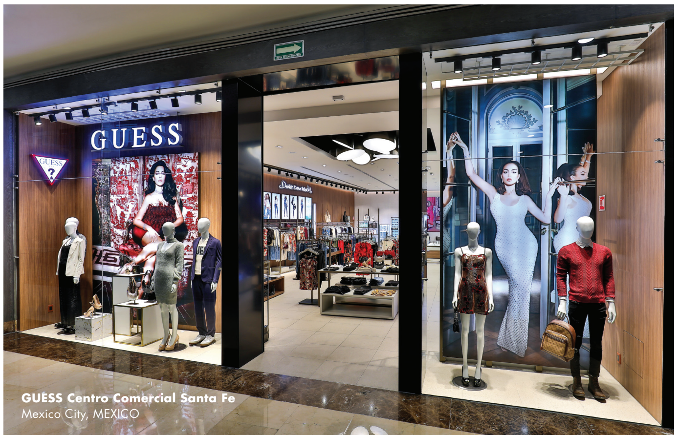
GUESS Centro Comercial Santa Fe Mexico City, MEXICO