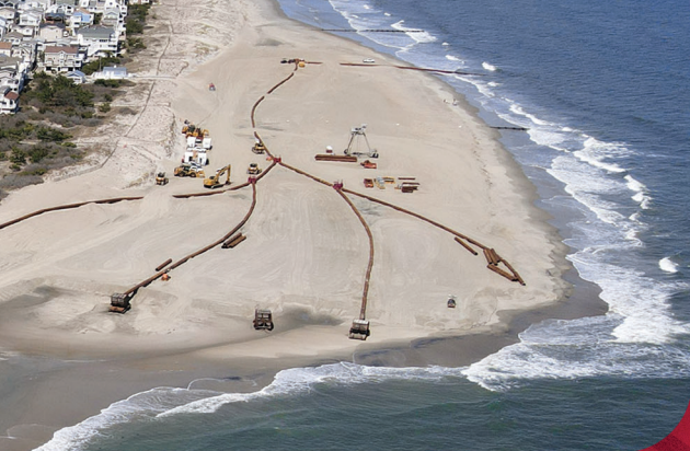
ABOVE: The Great Egg Harbor Inlet Beach Renourishment Project, New Jersey for the U.S. Army Corps of Engineers, Philadelphia District.