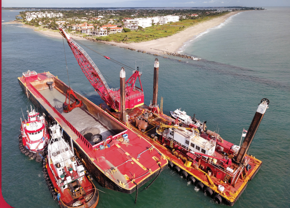
RIGHT: Mechanical Dredge 54 maintenance dredging of the St. Lucie, Florida entrance channel and impoundment basin for the U.S. Army Corps of Engineers, Jacksonville District.

Jones Act compliant subsea rock installation vessel, is currently under construction and has secured offshore wind rock placement contracts for Equinor’s Empire Wind 1 and Ørsted’s Sunrise Wind projects to protect foundations and cables. In addition, during the fourth quarter, we signed a vessel reservation agreement for the Acadia for another wind project in the United States. All three of these projects are fully permitted and we believe will not be directly impacted by the President’s Executive Order pausing issuance of new offshore wind leases and permits.