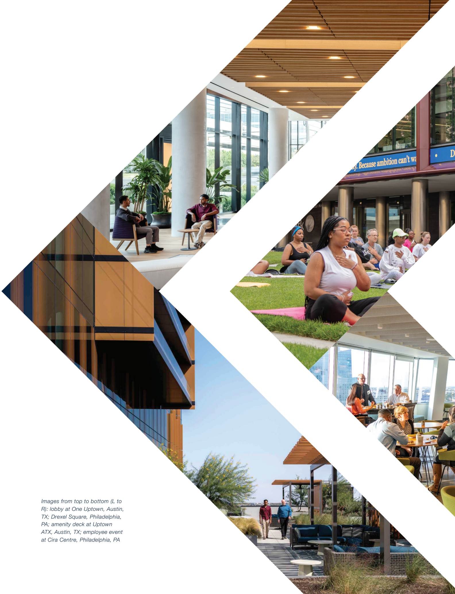
Images from top to bottom (L to R): lobby at One Uptown, Austin, TX; Drexel Square, Philadelphia, PA; amenity deck at Uptown ATX, Austin, TX; employee event at Cira Centre, Philadelphia, PA