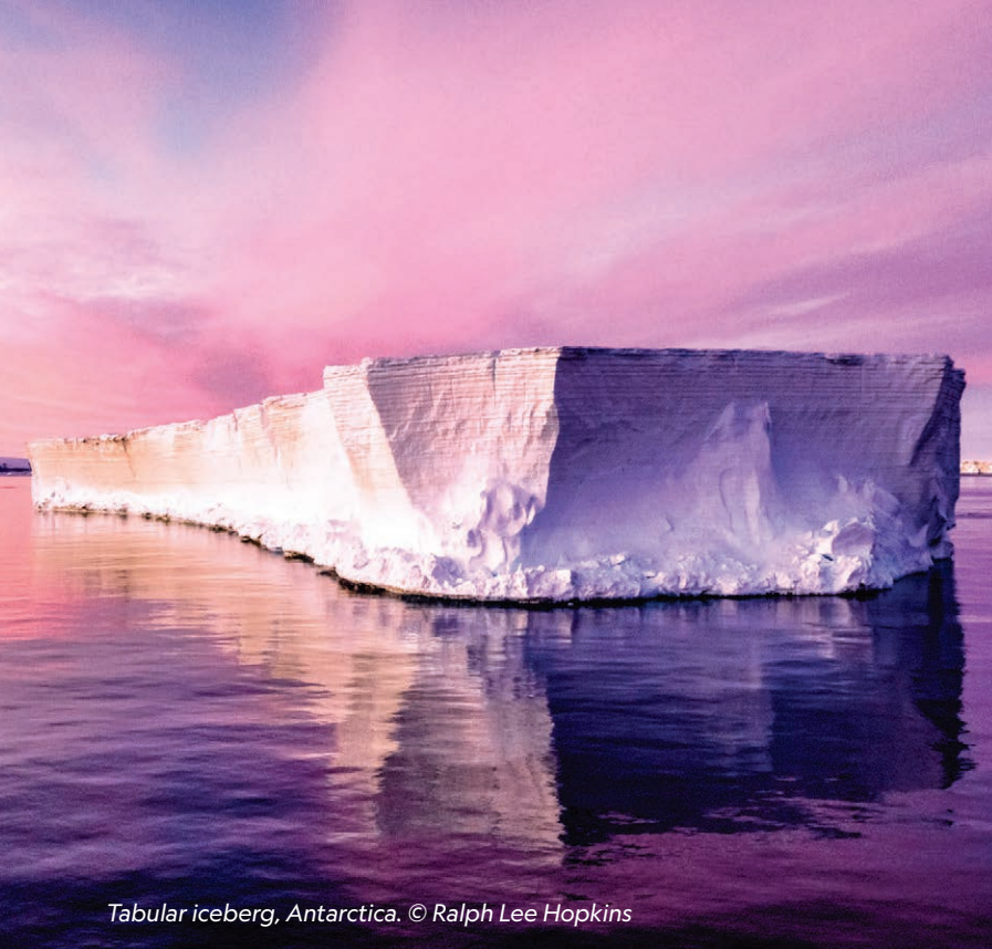
Tabular iceberg, Antarctica.