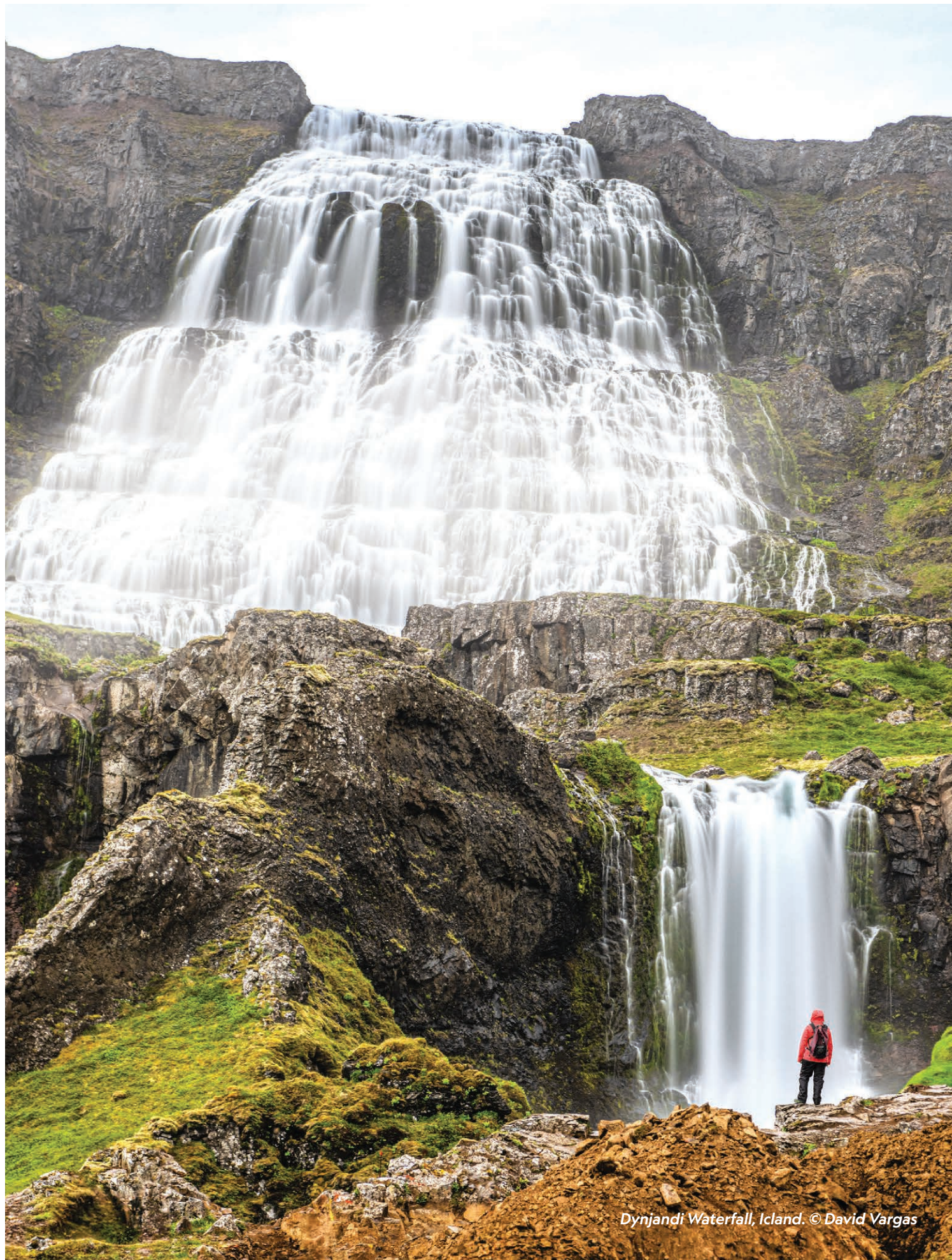
Dynjandi Waterfall, Iceland.