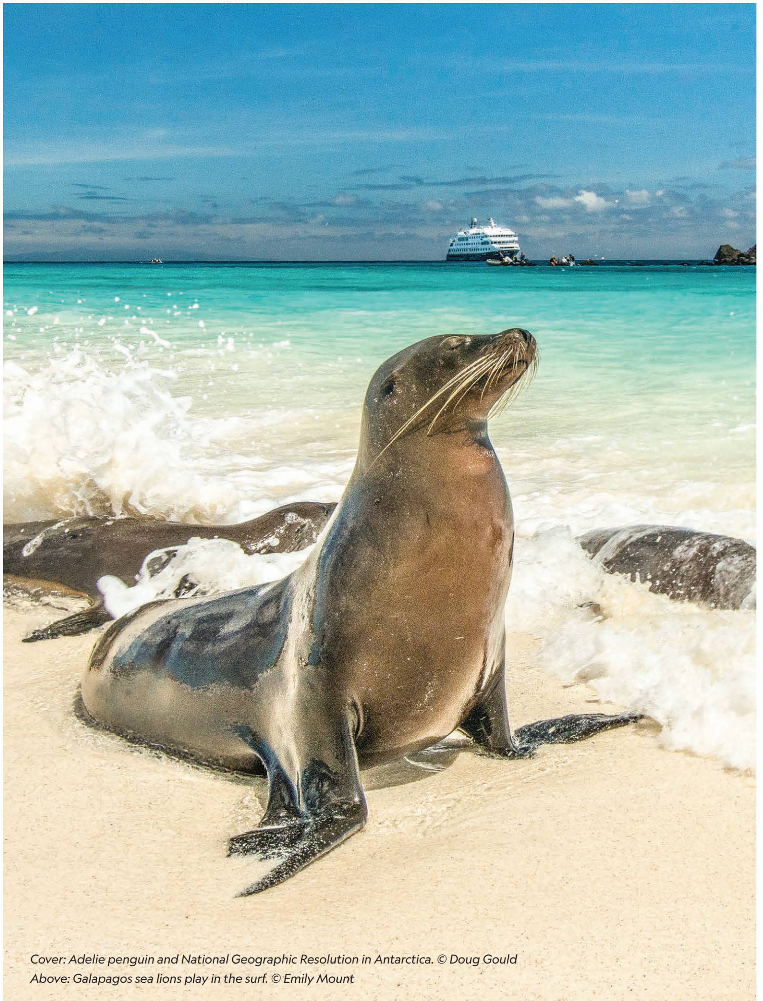
Cover: Adelie penguin and National Geographic Resolution in Antarctica. Above: Galapagos sea lions play in the surf.