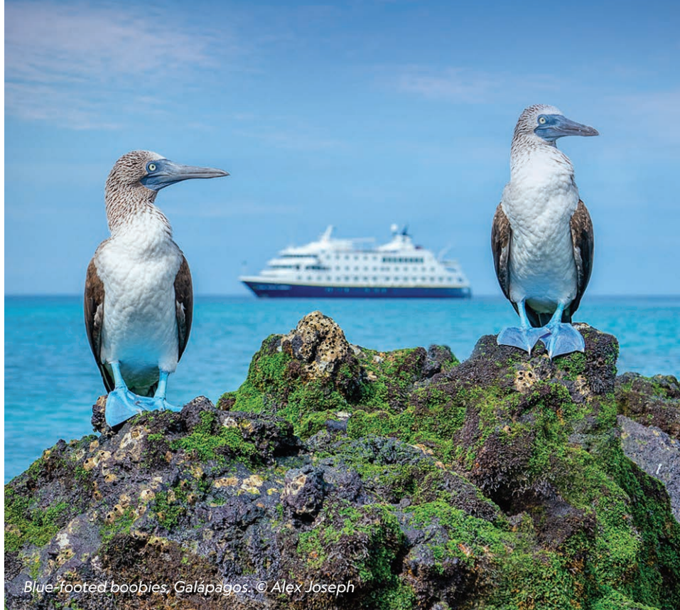
Blue-footed boobies, Galápagos.