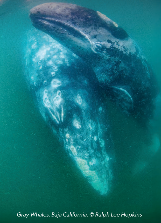
Gray Whales, Baja California.