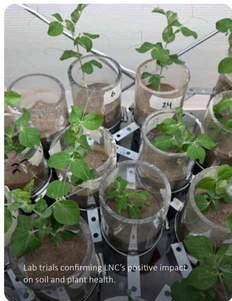
Lab trials confirming LNC's positive impact on soil and plant health.

Ongoing pilots with real estate developers, golf courses, and government entities continue to advance toward long-term commercial contracts. These efforts align with regional strategies to integrate LNC technology into water conservation frameworks, strengthening the technology's position in sustainable land and water management.