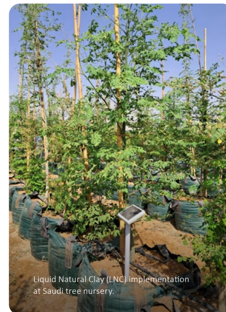
Liquid Natural Clay (LNC) implementation at Saudi tree nursery.

A new commercial contract for around 1.8 million liters of LNC for water conservation for landscaped areas was secured for a leading real