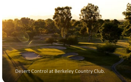
Desert Control at Berkeley Country Club.

Desert Control continued to gain momentum in the U.S. agriculture and landscaping sectors with eight new installations completed during the third quarter, growing the project portfolio to 42 projects. Golf and turf pilots in California achieved irrigation savings of over 25%, with some clients reporting water reductions exceeding 50%. These positive results empower negotiations for larger projects with new and existing clients, as demonstrated by the post quarter milestone of November 8th, announcing the first agreement for a complete golf course deployment with Berkeley Country Club.