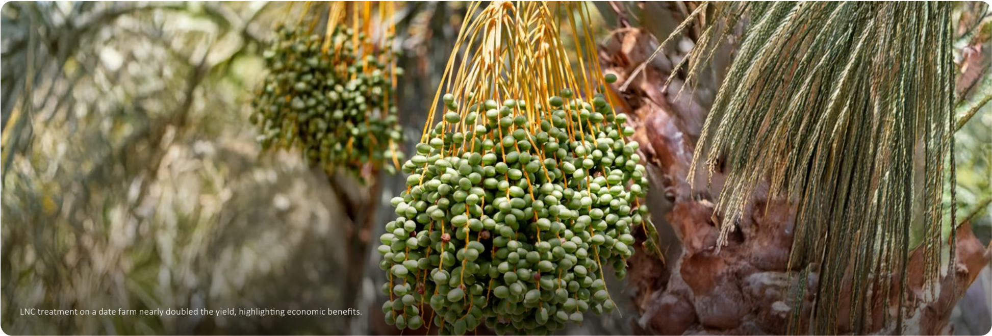
LNC treatment on a date farm nearly doubled the yield, highlighting economic benefits.

Bank deposits earns a low interest at floating rates based on the bank deposit rates.