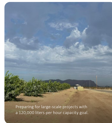
Preparing for large-scale projects with a 120,000 liters per hour capacity goal.

Development of the next-generation LNC production system progressed as planned during the quarter, with throughput capacity nearing the target of 120,000 liters per hour.