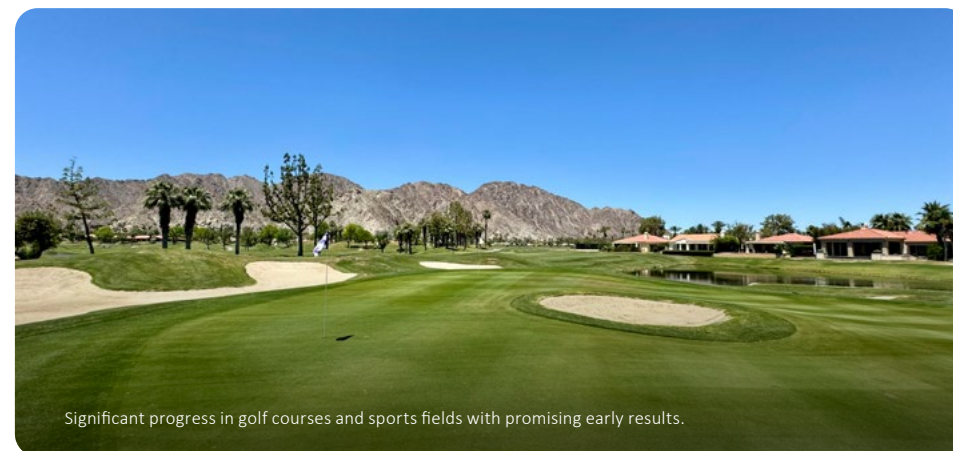
Significant progress in golf courses and sports fields with promising early results.