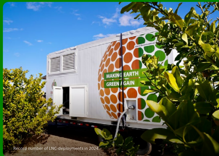
Record number of LNC-deployments in 2024.

Desert Control's focus on R&D, operational efficiency, and technology enhancement continues to pave the way for sustainable, scalable growth. Every advancement in technology, production systems, and deployment capabilities strengthens the company's ability to address global soil and water conservation challenges.