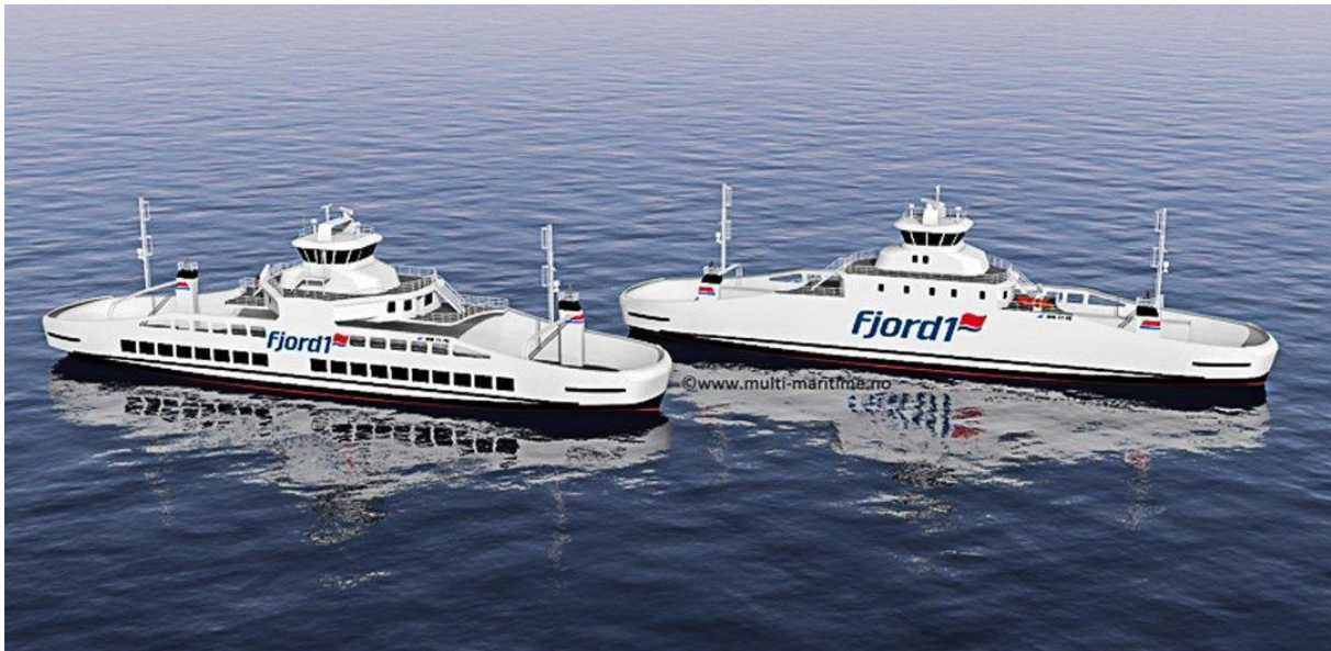
3 new ferries for Fjord1 – designed by Multi Maritime