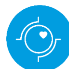
role in society

We are convinced that our strategy – powered by our culture and the efforts of our people – helps us earn, keep and grow trust day by day and, therefore, gives us the capacity to become the reference in our core markets.