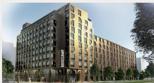
Malmö - Sweden