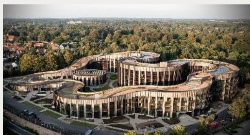
Lyngby - Denmark