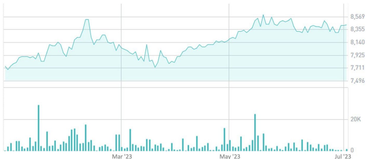
AdB share performance (01/01/2023-30/06/2023)

On June 30, 2023, the official share price was Euro 8.36 per share, resulting in an AdB Group market capitalisation of Euro 302 million at that date.