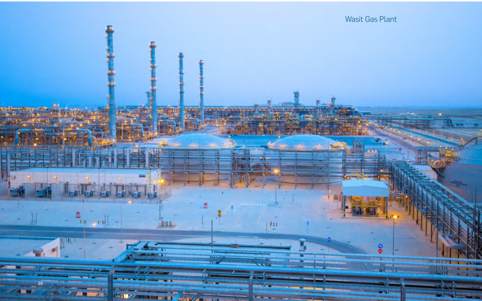
Wasit Gas Plant

If the answer to any of these questions is not clear, or if we are uncomfortable with our answer, we must seek guidance from our managers or Integrity Officers .