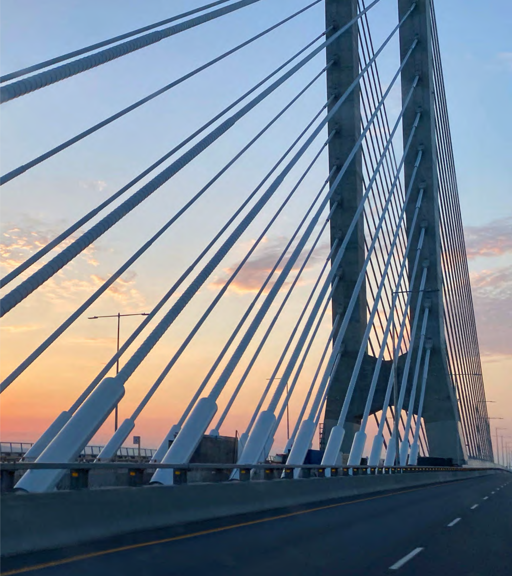
Samuel De Champlain Bridge