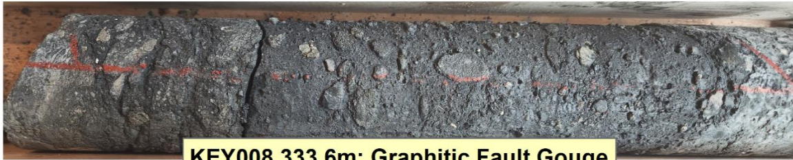
KEY008 333.6m: Graphitic Fault Gouge