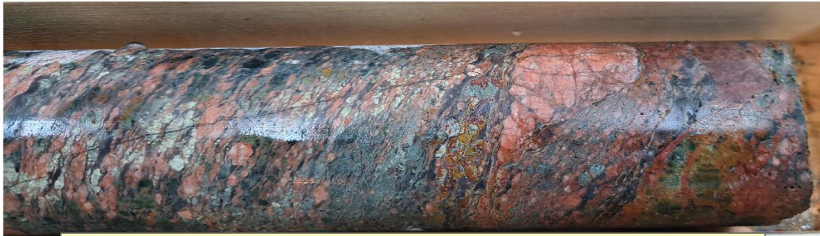
KEY010 243m: Elevated Radioactivity with Limonite + Chlorite