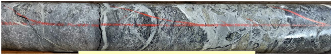
KEY010 235m: Fault Breccia with Clay