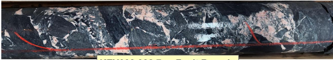
KEY008 332.7m: Fault Breccia