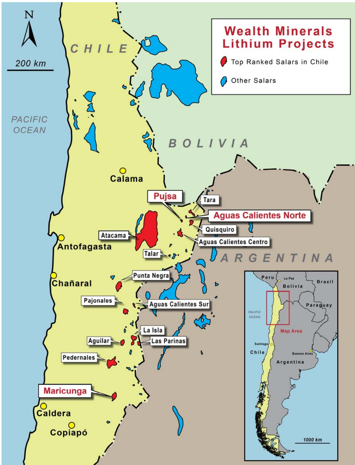
Figure 1: Map Showing 15 Salares (Salt Flats) Identified as the Most Prospective in Chile by Chile's Servicio Nacional de Geología y Minería, with Salares in which Wealth has the Right to Earn an Interest Identified in Red