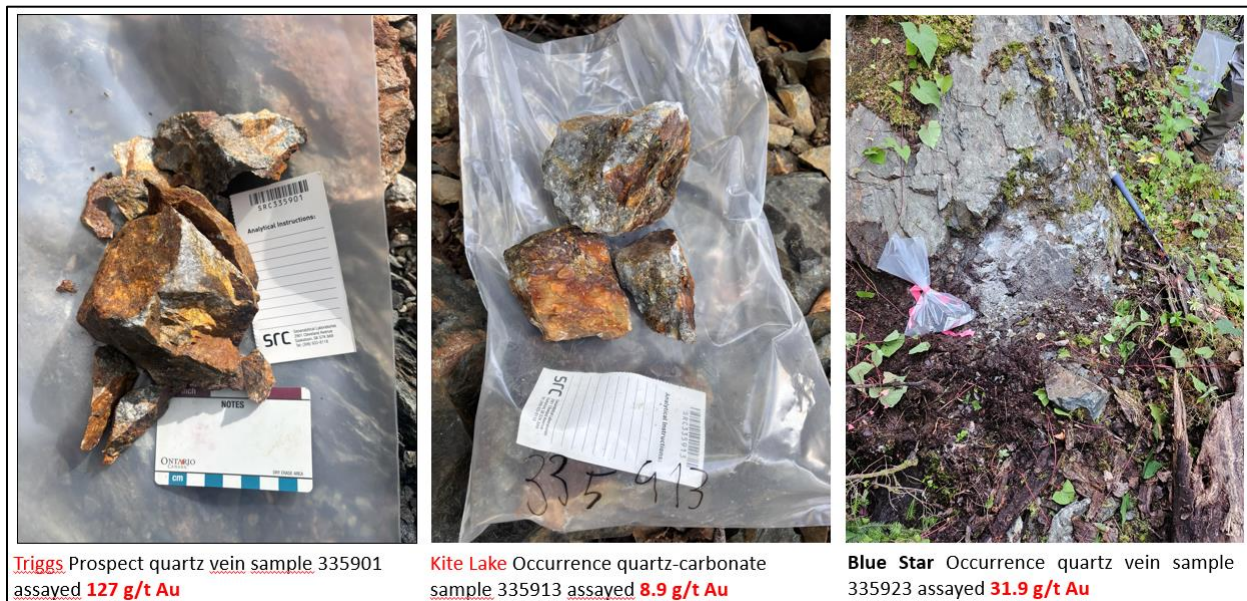
Figure 2. Photographs of Selected Due Diligence High-Grade Samples Collected by NAM Technical Representatives