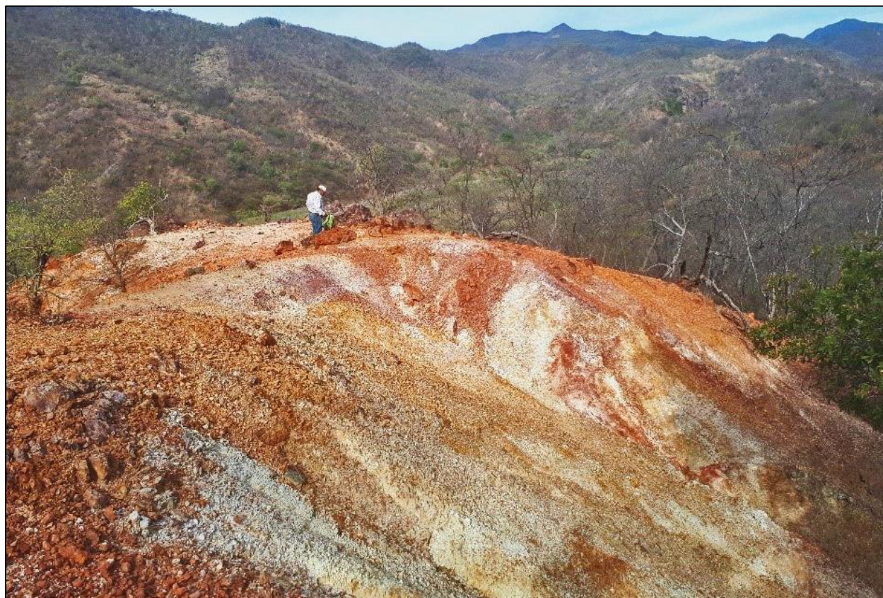
Figure 3. Ridge located >50 metres above the valley floor, showing intense bleaching, oxidation and argillic alteration adjacent to large precious metal and polymetallic anomaly shown in Figures 1 and 2.

The 1,130-hectare Property is easily accessible from Hermosillo to the Tepoca area and heading south from Mexican Highway #16 or west from Highway #117, or from Ciudad Obregón travelling northeast on Hwy. #117 and west to the pueblo of La Quema with vehicles and then pack teams along dry riverbeds, dirt roads and trails. High voltage power lines are located on Highway #16.