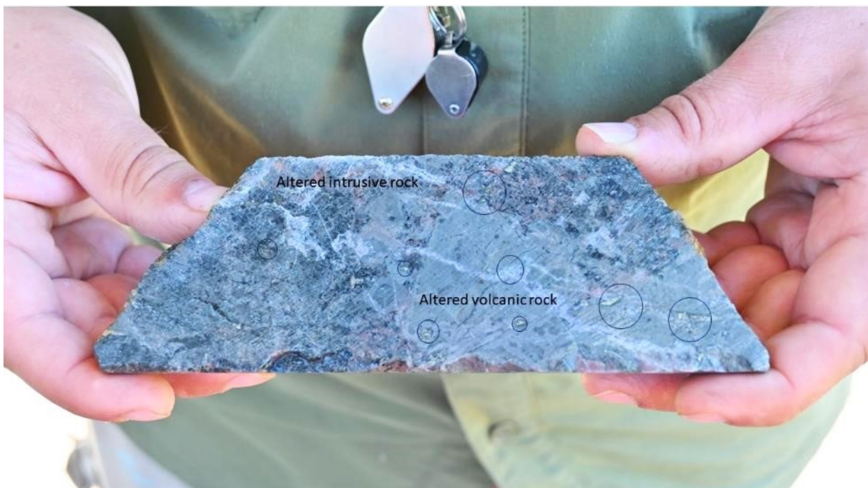
Figure 1: Sample from DK2023-001 showing breccia texture comprised of intrusive and volcanic rocks. Black circles highlight chalcopyrite.

The first drill hole from the 2023 program is testing an area with elevated copper in rock and soil samples, mapped potassic and phyllic alteration within a mineralized breccia on surface and a chargeability feature that penetrates to depth. Drilling to date has intersected over 200 metres (with the hole still advancing) of phyllic and potassic alteration with associated mineralization, including an upper oxide and lower sulphide zone. Mineralization occurs within a healed breccia, as disseminations, fracture coatings, veins and veinlets and includes chalcopyrite, pyrite, chalcocite, and malachite.