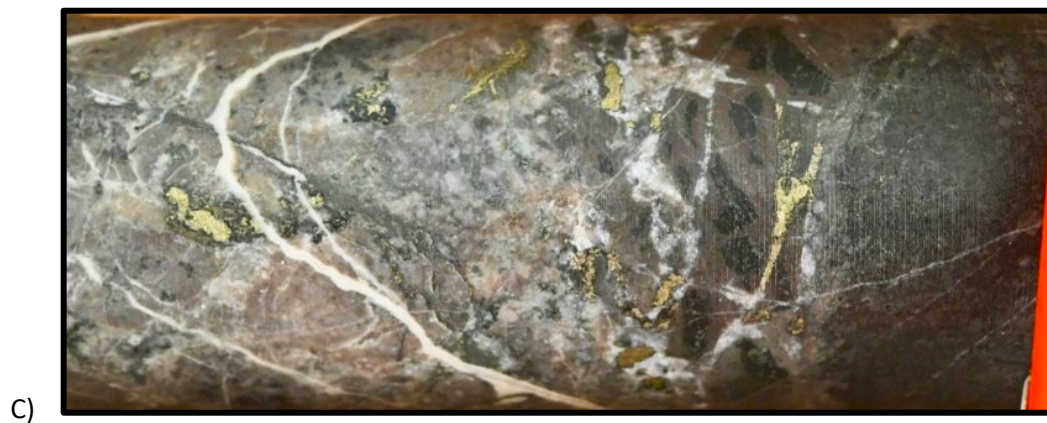
Figure 2 – select core intervals from first hole showing chalcopyrite mineralization.