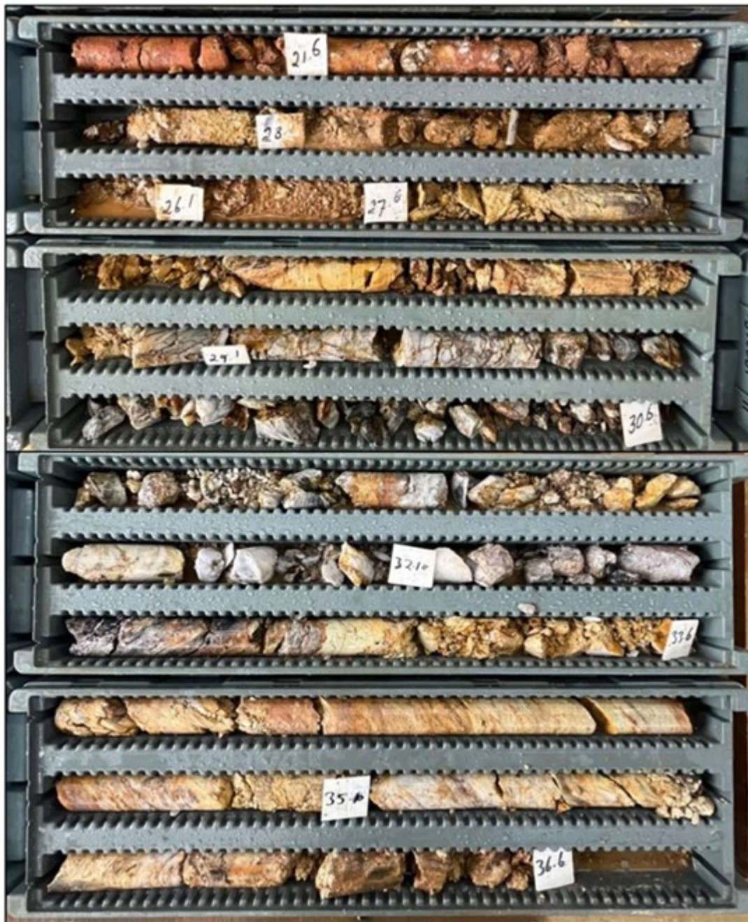
Figure 3: Photo of Drill Core from VG001 Drill Hole (currently drilling)

To view an enhanced version of this graphic, please visit: https://images.newsfilecorp.com/files/7574/237828_figure3.jpg