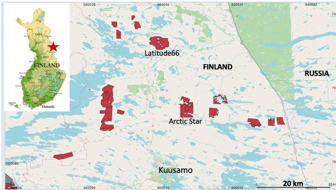
Figure 1 : Location of the Timantti project, Red star in inset depicts location in relation to Finland, 11km NE of the Town of Kuusamo.