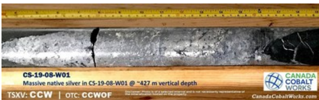
Core Photo 1 - CS-19-08-W01