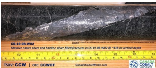
Core Photo 2 - CS-19-08-W02