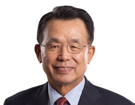
Dr Han Seung-soo, KBE Non-executive Director Resolution 11