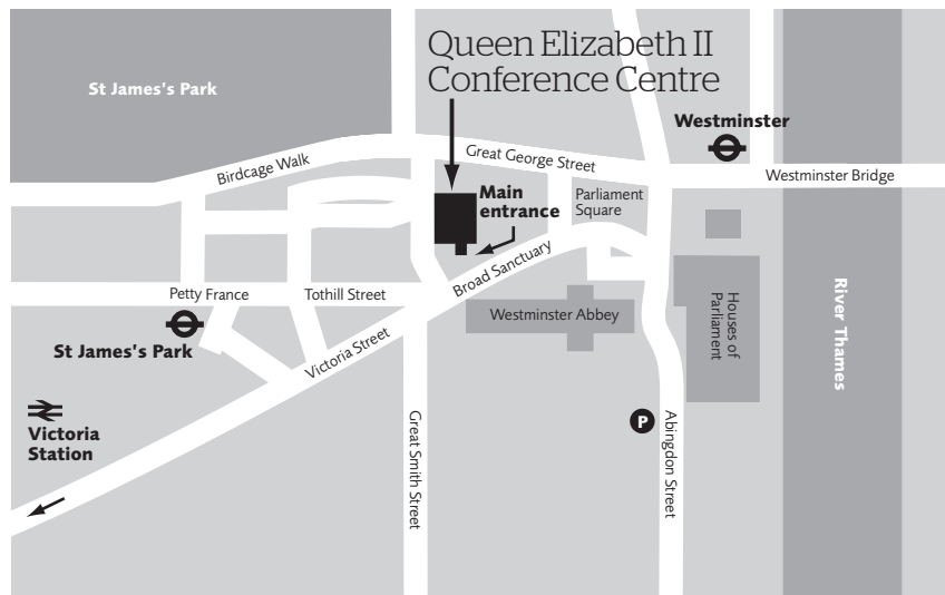
Queen Elizabeth II Conference Centre, Broad Sanctuary, Westminster, London SW1P 3EE The Queen Elizabeth II Conference Centre operates a security system. Cameras and recording devices are not permitted in the auditorium.