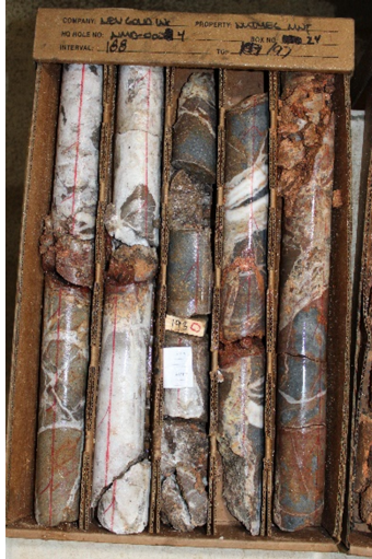
Figure 2 – Core Photos – NMD0004 from 57.3 meters to 60.0 meters (188 to 197 ft.), assays pending. To view image please click here