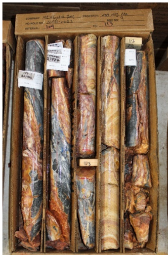
Figure 3 – Core Photos – NMD0003 from 31.7 meters to 34.4 meters (104 to 113 ft.), part of the zone that assayed 13.4 meters at 2.32 g/t Au. Released on April 13, 2023. To view image please click here