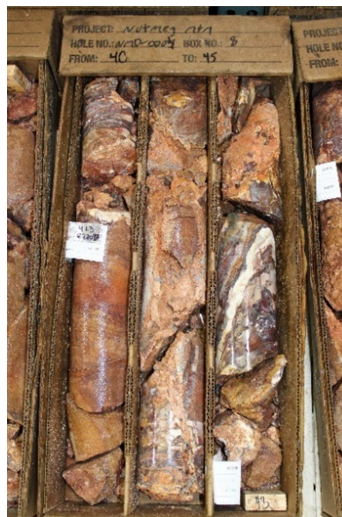
Figure 1 – Core Photos – NMD0004 from 12.2 meters to 13.7 meters (40 to 45 ft.), assays pending . To view image please click here

NevGold CEO, Brandon Bonifacio, comments: “It is very positive to see our inaugural drill program continue to track at Nutmeg Mountain. We eagerly await assay results from Hole NMD0004 which is currently cut and at American Assay Lab in Sparks, Nevada, with final assays pending . The signatures that we are seeing at or near surface are encouraging. Our technical group is gaining a strong understanding of the regional and localized structures and textures having spent the past 10 months re-logging historical drilling, and after each drillhole is completed in this program. We are looking forward to providing further updates over the coming weeks and months from the drill program. ”