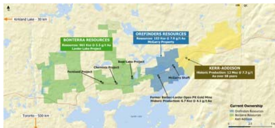
McGarry Property in relation to Kerr-Addison Mine & Bonterra's Larder Lake Project - Figure 1

For the latest updates please contact or follow us on Twitter @OrefindersR