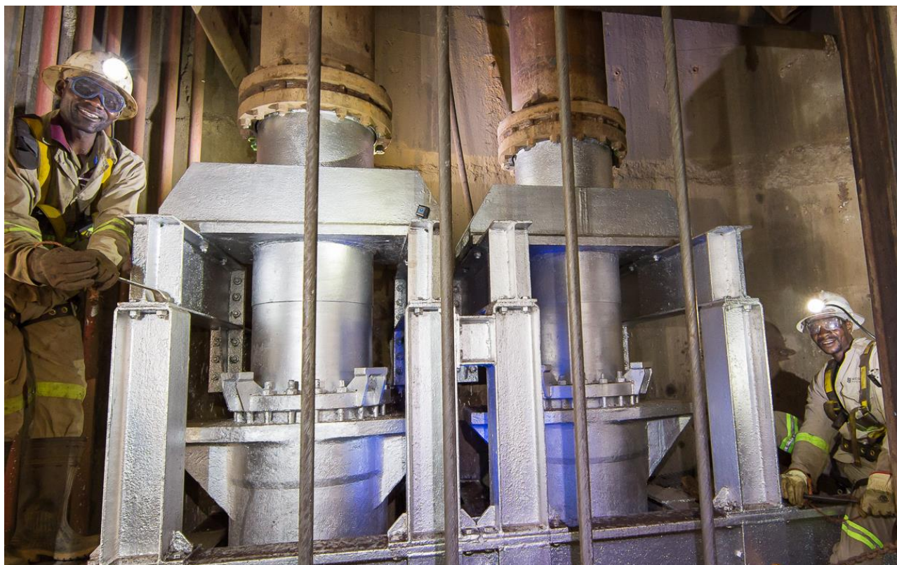
Figure 6: Upgraded supports for Shaft 5 pump columns at the 1,200-metre-level pump station.

Preparations are underway to start a 6,500-metre drilling program at Kipushi. The planned program, which is expected to begin later this month, will include six metallurgical holes and additional resource drilling in the Fault Zone and the Nord Riche and Southern Zinc zones to upgrade inferred resources to indicated resources.