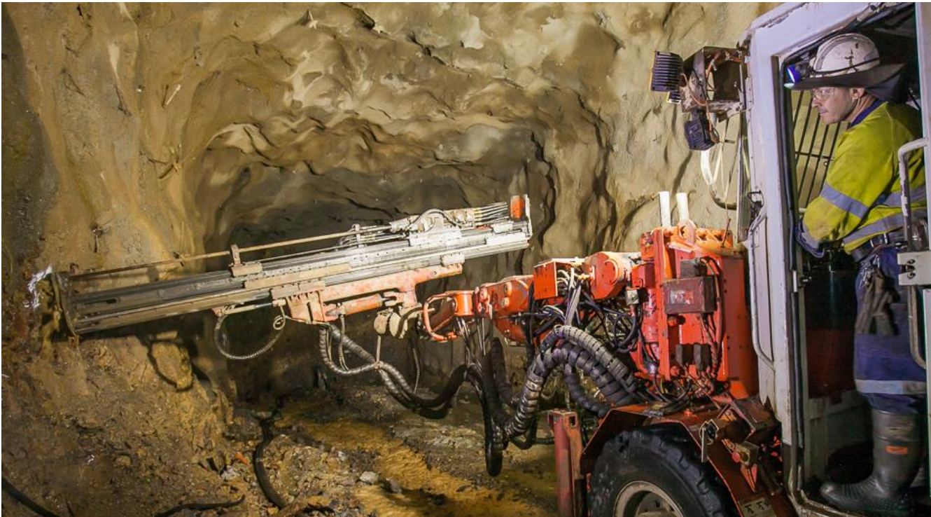
Figure 10: Operating the underground drill rig during decline development.

The service and conveyor declines each have been advanced more than 770 metres and are in Kamoia pyritic siltstone, which overlies the copper ore. Development of the underground mine is scheduled to reach the high-grade copper mineralization at the Kansoko Sud Deposit during Q2 2017.