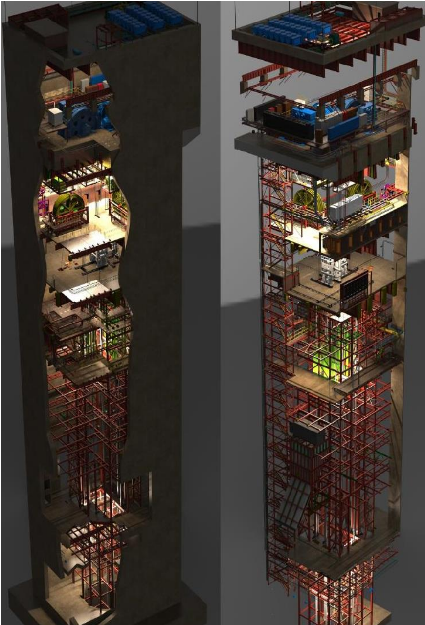
Figure 3: Illustration shows two perspectives of Shaft 2's 103-metre-tall concrete headgear, the hitch (foundation) and internal permanent hoisting facilities.

The early works for Shaft 2 will include the excavation of a surface box cut to a depth of approximately 29 metres below surface and the construction of the concrete hitch (foundation) for the 103-metre-tall concrete headgear (headframe) that will house the shaft's permanent hoisting facilities and support the shaft collar. The early works are planned to commence in Q2 2017 and will take approximately 12 months to complete.