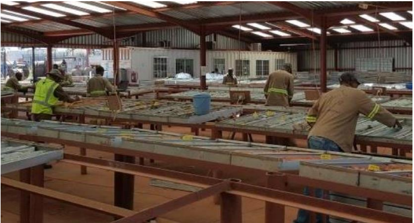
Figure 8: Exploration staff processing Kakula drill core at the Kamoia camp facility.

The Kakula Discovery remains open along a westerly-southeasterly strike. Importantly, the chalcocite-rich zone of mineralization in DD1124 was intersected at a depth of approximately 400 metres below surface, significantly shallower than several of the mineralized intercepts announced in January 2017 that were drilled closer to the western boundary of the Kakula Inferred Resource