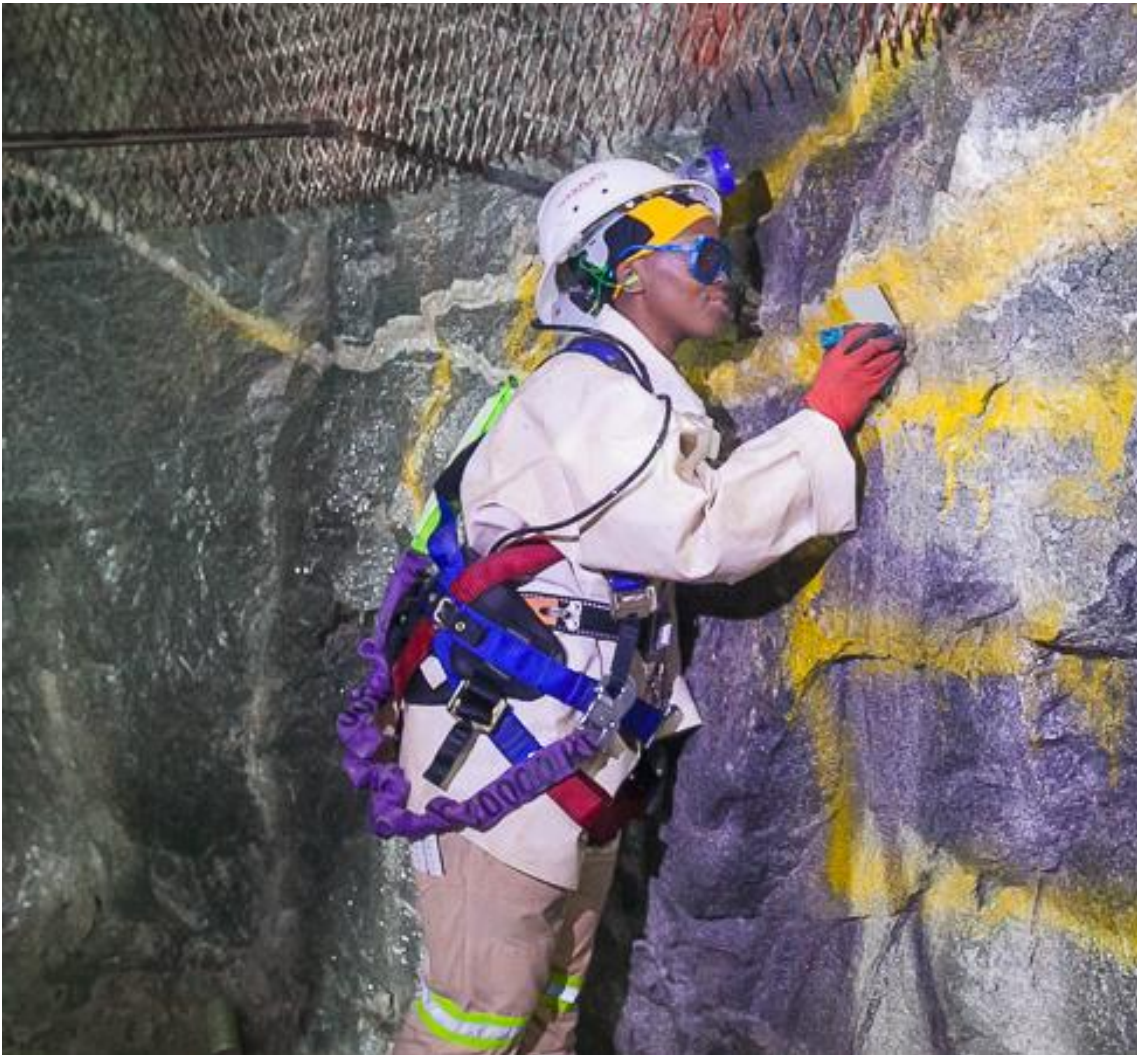
Figure 1: A Platreef engineer examining geotechnical features of the Shaft 1 sidewall.

An average sinking rate of 45 metres per month is expected during the main sinking phase. The shaft includes a 300-millimetre concrete lined shaft wall. The main sinking phase is expected to reach its projected, final depth of 980 metres below surface in 2018. Shaft stations to provide access to horizontal mine workings for personnel, materials, pump stations and services will be developed at depths of 450, 750, 850 and 950 metres below surface.