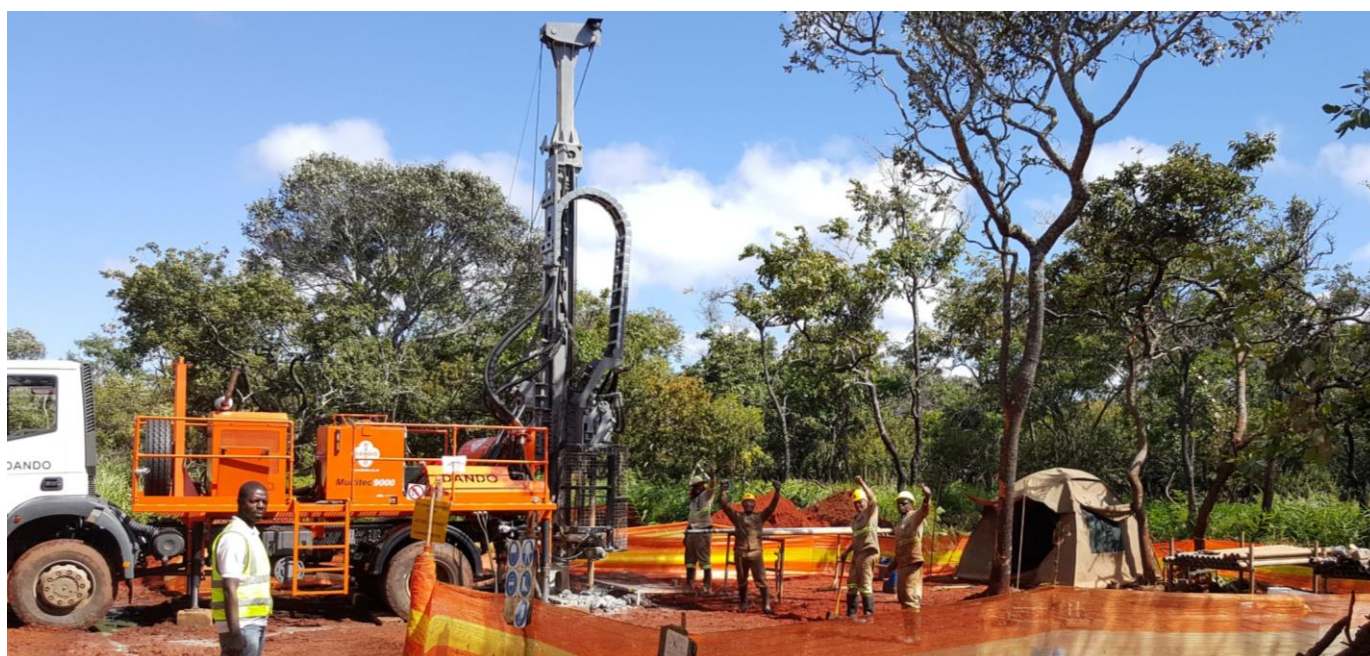
Figure 7: Drilling at Kakula West.

On April 10, 2017, Ivanhoe announced the assay results for DD1124 that confirmed significant high-grade mineralization. DD1124 intersected 8.86 metres (true width) of 5.83% copper at a 3.0% copper cut-off, beginning at a downhole depth of 428.70 metres; 8.86 metres (true width) of 5.83% copper at a 2.5% copper cut-off; 16.05 metres (true width) of 4.14% copper at a 2.0% copper cut-off; and 16.05 metres (true width) of 4.14% copper at a 1.0% copper cut-off. DD1124’s best six-metre intercept was 6.17 metres (true width) at 6.84% copper.