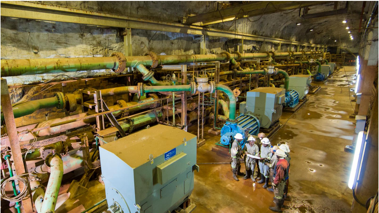
Figure 4: Shaft 5 main pumping station at the 1,200-metre level.

Engineering work has focused on the upgrading of Shaft 5 conveyances and infrastructure, installation of the rock conveyor system, the stripping and evaluation of the underground jaw crusher, refurbishment of bearer sets on the main rising-water pipes, and the replacement of shaft buntons (struts that reinforce the shaft walls). A new twinned high-volume ventilation fan also has been installed and is being commissioned on surface at Shaft 4 to provide fresh air to the underground workings.