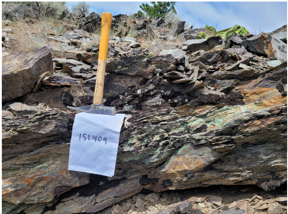
Figure 3. Rock sample from outcrop within historical mineralized trench located along strike between the central and southern showings.