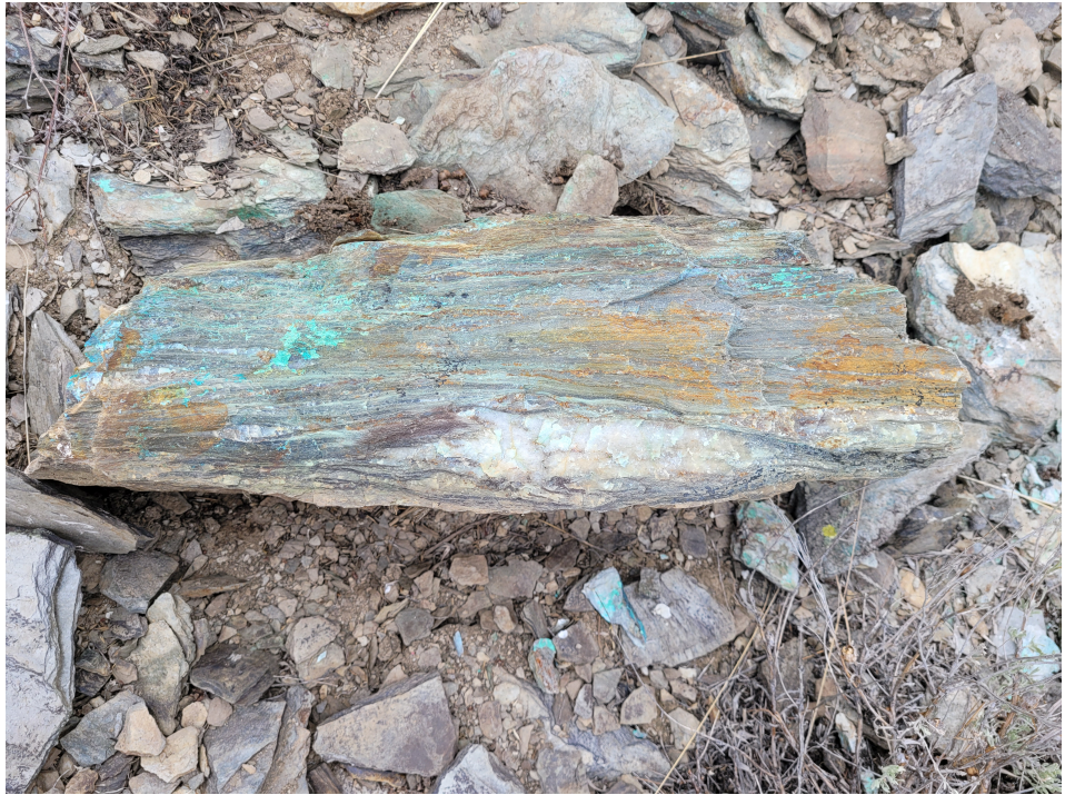
Figure 2. Copper oxide staining on rocks located in a newly discovered historical pit in the south of the property.