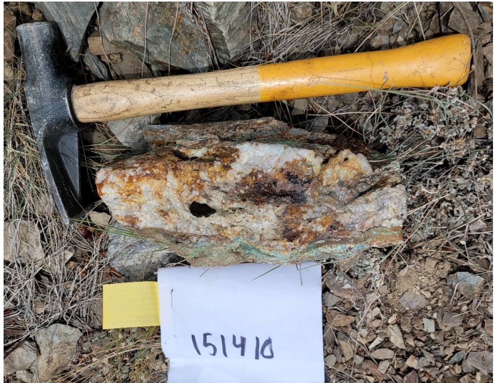
Figure 4. Rock sample from historical mineralized trench located along strike between the central and southern showings.

Data collected during the summer/fall 2021 exploration programs at Monument Peak will be utilized to prepare an independent technical report and be used for the generation of drill targeting / permitting.