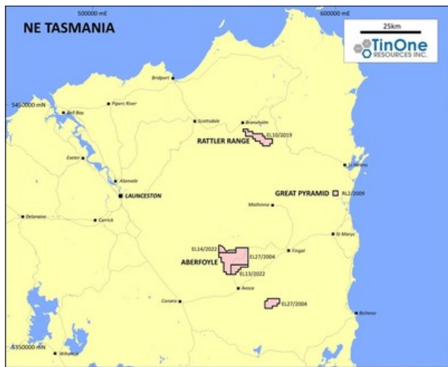
Figure 1: Rattler Range tin project location

The acquisition of Rattler Range is subject to satisfaction of certain closing conditions including, among other things, the approval of the TSXV. All securities issued in connection with the Definitive Agreement are subject to a hold period expiring four months and one day from the date of issuance. It is anticipated that the acquisition will close in September, 2022.