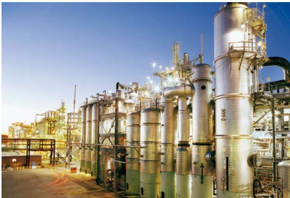
With environmentally friendly products and modern, efficient production facilities like this one in Baytown, United States, Bayer is helping to cut down emissions of greenhouse gases.