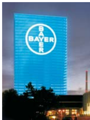
The Bayer tower will be seen in a new light from spring 2009.

proclaiming the location of the company's global headquarters. The new media facade is due for completion in spring 2009.