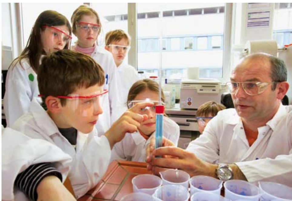
Supporting young scientists is part of the focus of the Bayer Group's reorganized foundation activities. Our picture shows school students conducting various scientific experiments in the BayLab in Wuppertal.

Leverkusen. Bayer AG is strengthening its commitment in the areas of education, science and social affairs by consolidating its existing foundation activities into two new foundations: the Bayer Science & Education Foundation and the Bayer Cares Foundation.