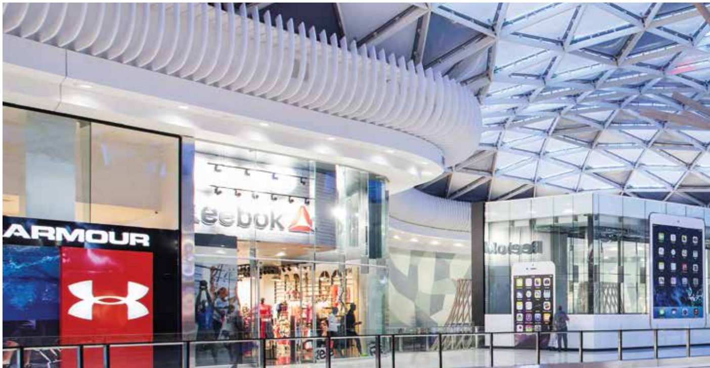
Mall of Africa - Waterfall City

All transactions between related parties during the year were at arm's length.