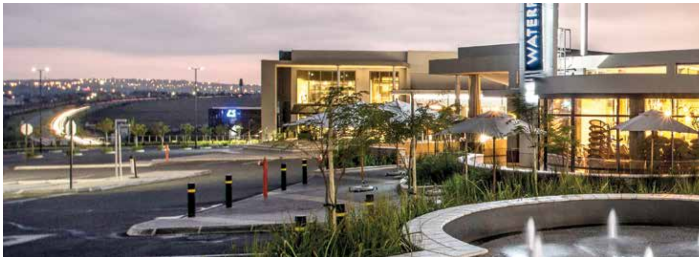
Waterfall Corner – Waterfall

The net asset values of the Group's interests in the underlying investments are deemed to approach the fair value less cost to sell.