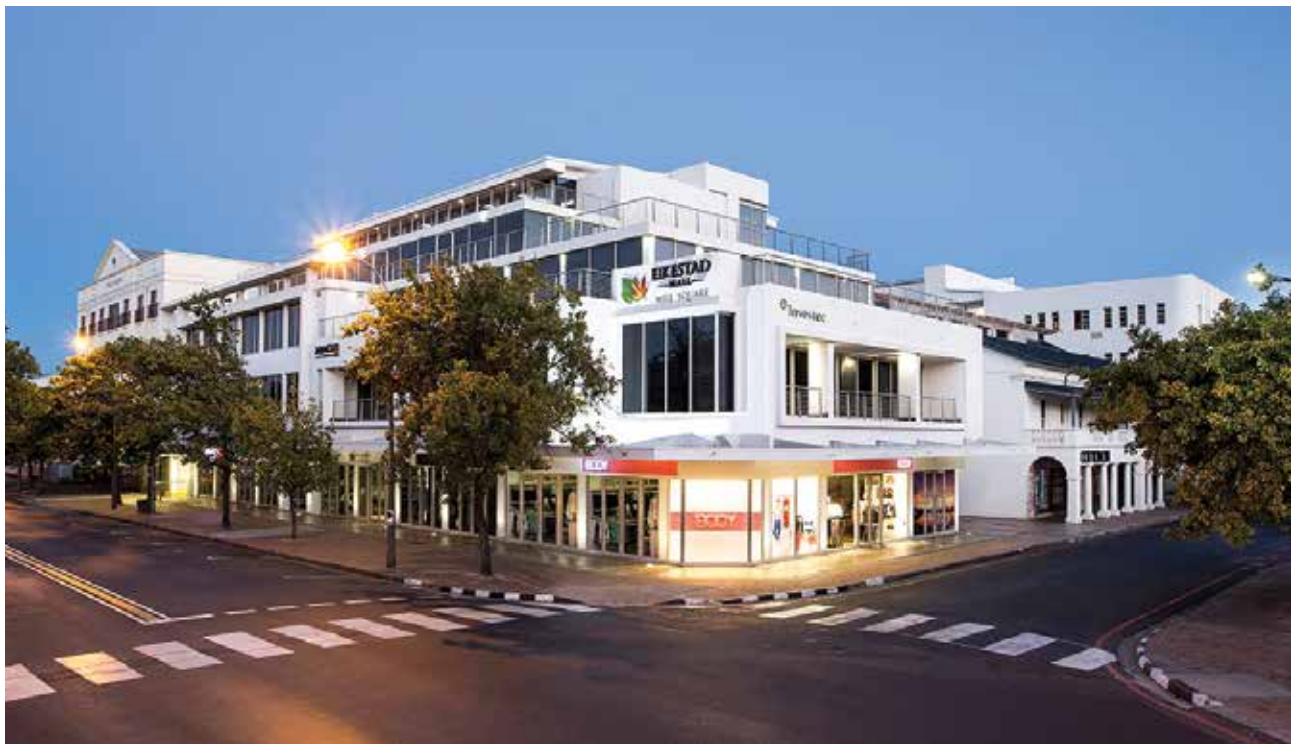
Eikestad Mall – Stellenbosch

The recognition is based on the future taxable profits derived from approved budgets and cash flow forecasts.