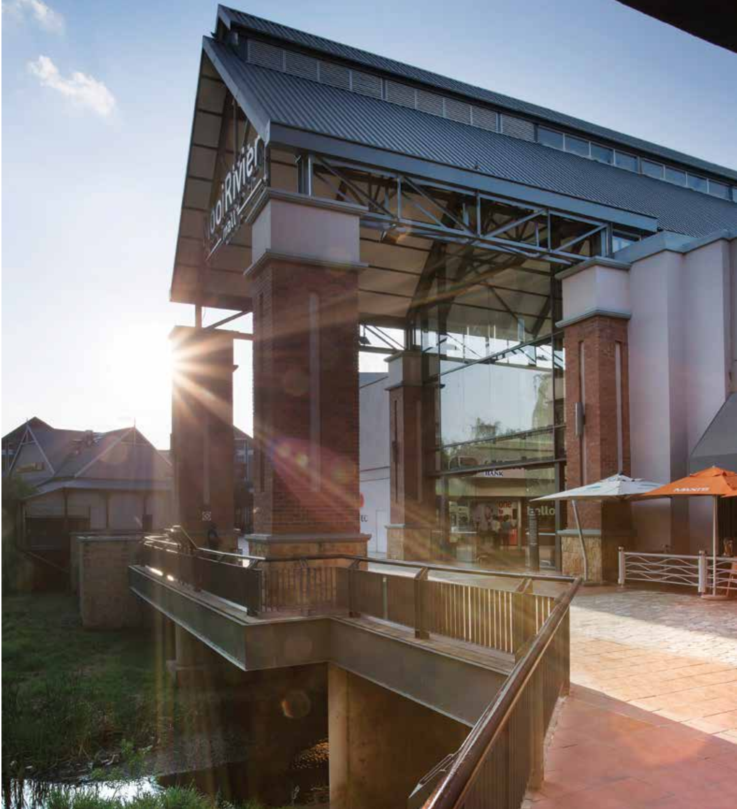
MooiRivier Mall - Potchefstroom