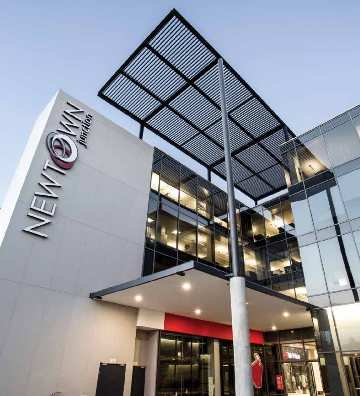
Newtown Junction - Johannesburg