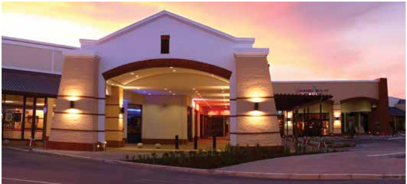
Garden Route Mall – George

The carrying values of the long-term borrowings are considered by management and Directors to approximate their fair values.