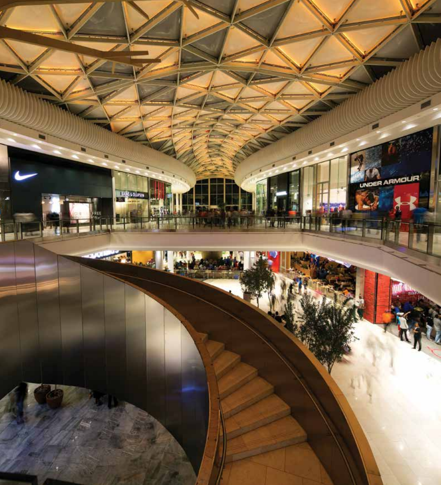
Mall of Africa - Waterfall City