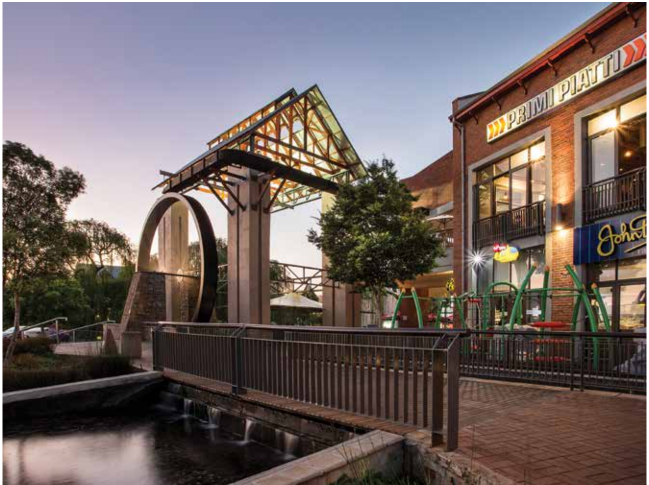
MooiRivier Mall - Potchefstroom

Unutilised facilities as detailed above, as at 30 June 2016, amounted to R290.0 million (2015: R200.0 million).