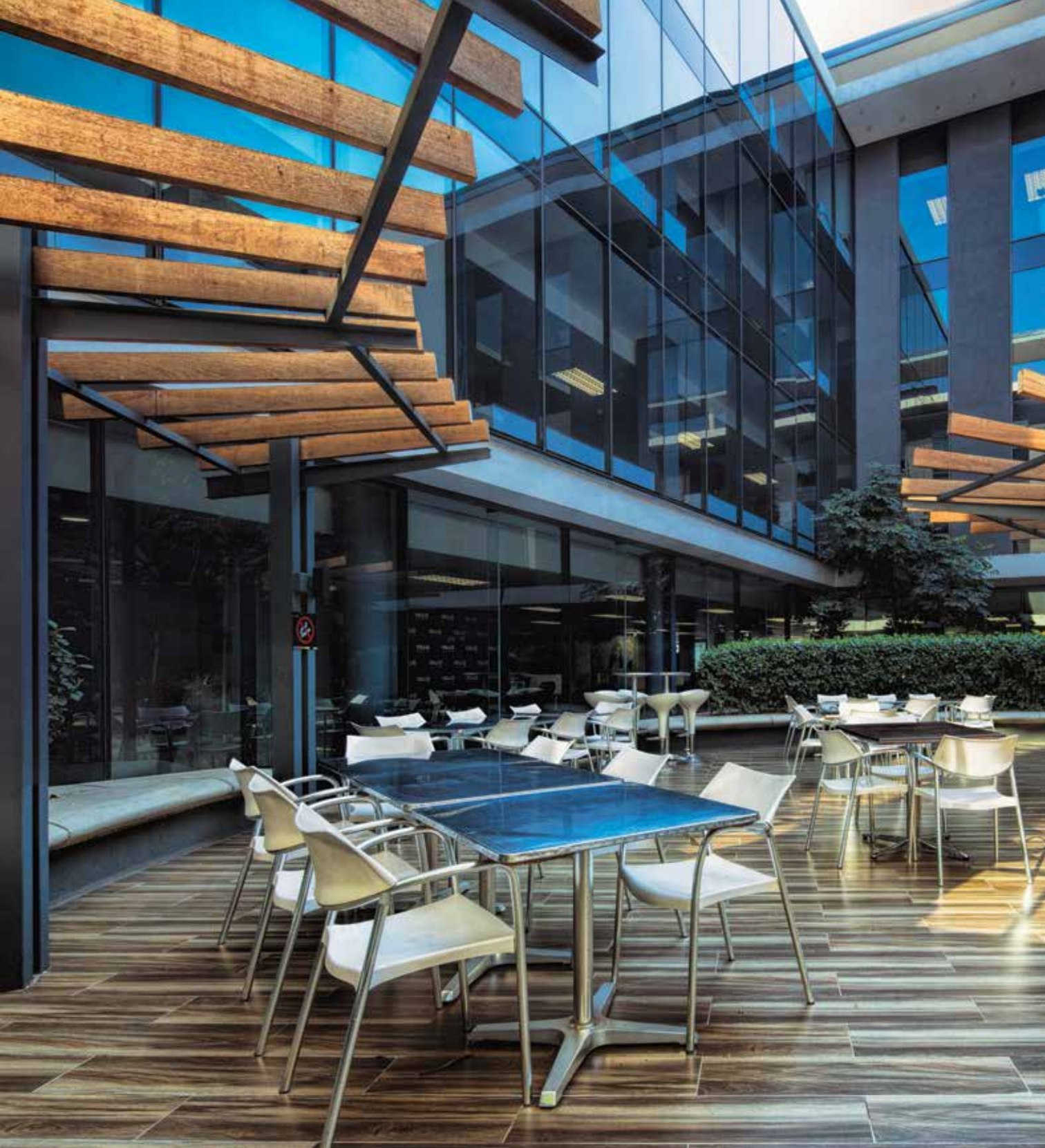
Cell C Campus - Waterfall