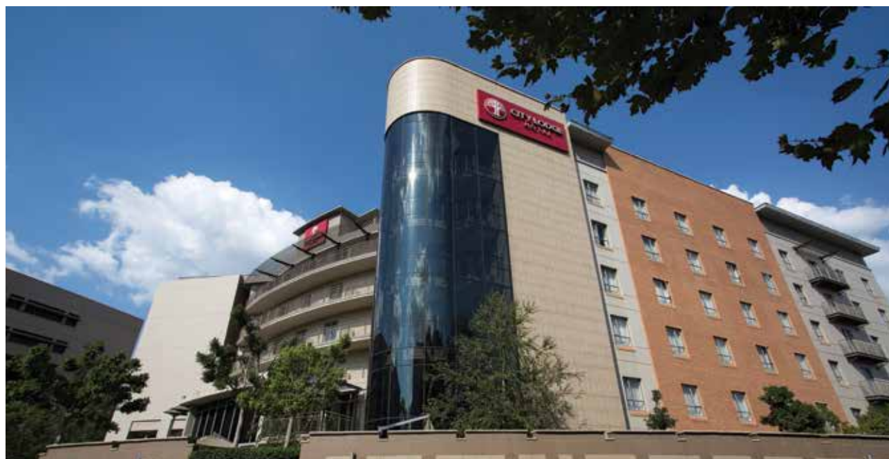
Lynnwood Bridge – Pretoria