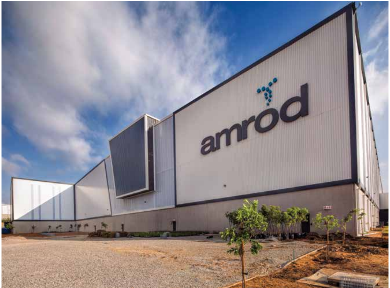
Amrod - Waterfall