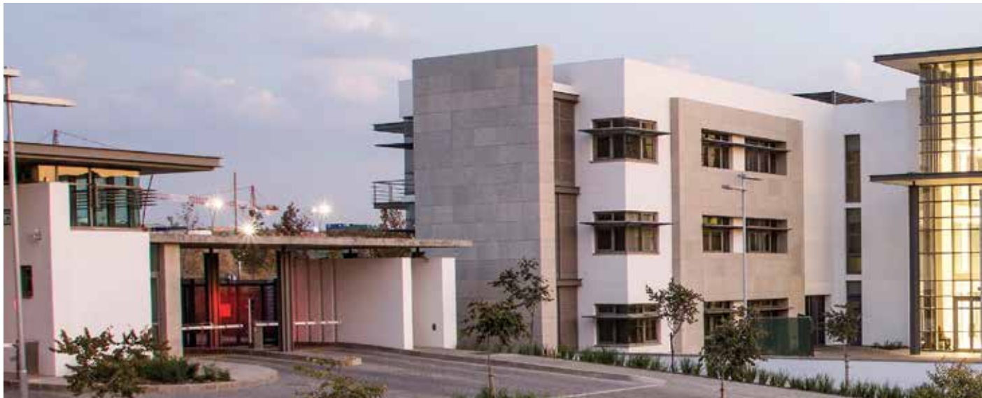
Maxwell Office Park – Waterfall City

The fair value (excluding forfeitures and performance conditions) per share granted under the three schemes mentioned above is the share price of Attacq Limited at grant date less expected dividends over the vesting period. Allowance is then made for expected forfeitures and the likelihood of performance criteria to be satisfied where these are applicable.