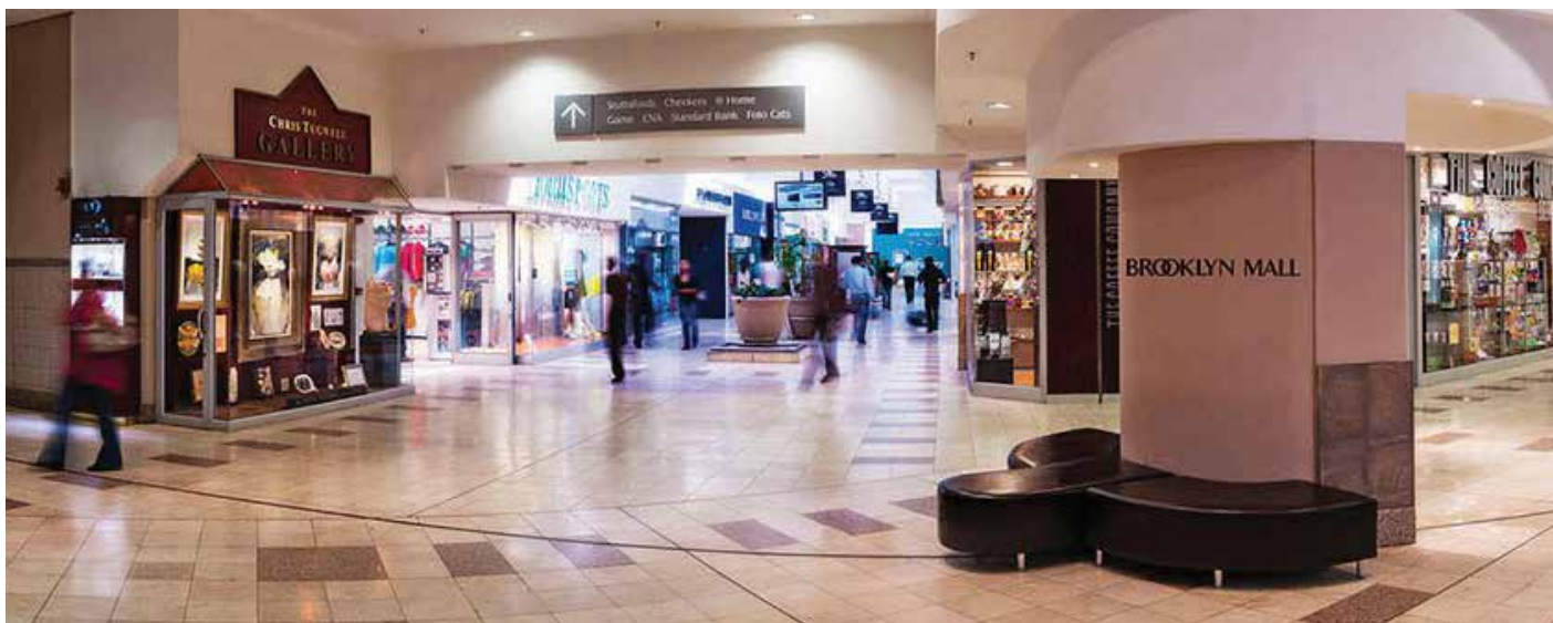
Brooklyn Mall – Pretoria

** The risk-free interest rates for discounting of future cash flows were determined from the bootstrapped zero coupon perfect fit swap curves. The swap curves as at the various grant dates were sourced from the Bond Exchange of South Africa, a subsidiary of the Johannesburg Securities Exchange.