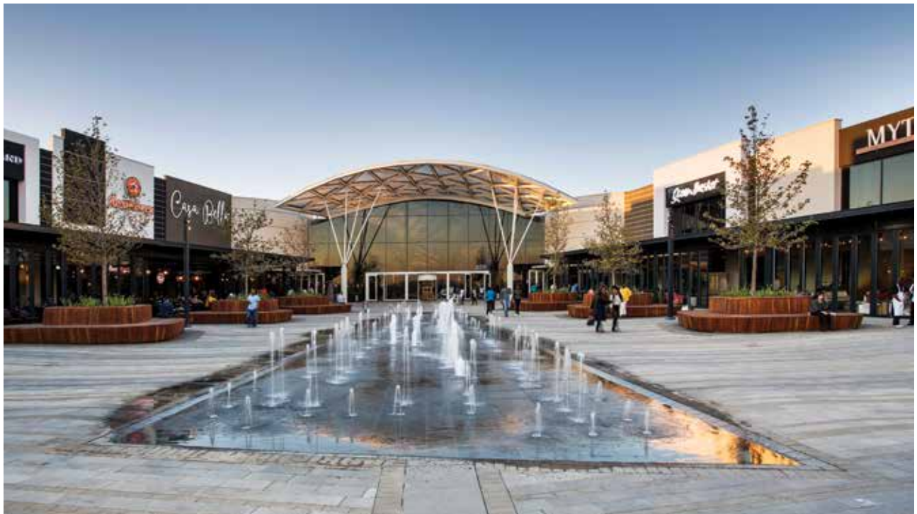
Mall of Africa - Waterfall City

The provision relating to leave pay for the current year was calculated based on the actual leave days outstanding at 30 June 2016 at the hourly rate per employee.