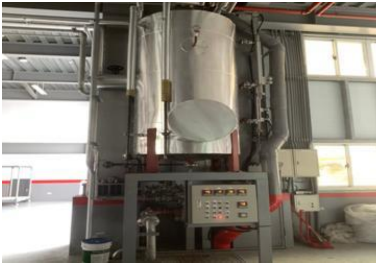
Condensate automatic recycling and energy-saving storage tank system