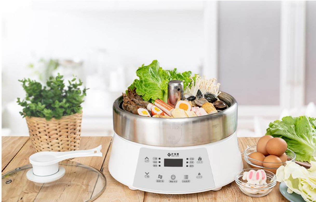
Automatic lifting hot pot