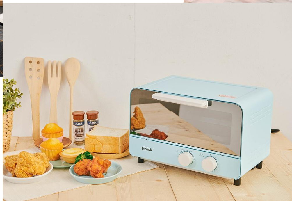
11L Electric Oven