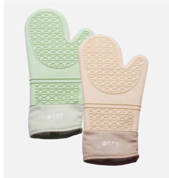
Silicone Oven Mitts