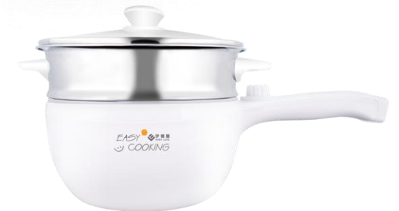
1.8L Electric Cooker Pot