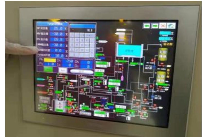
Central control system debugging