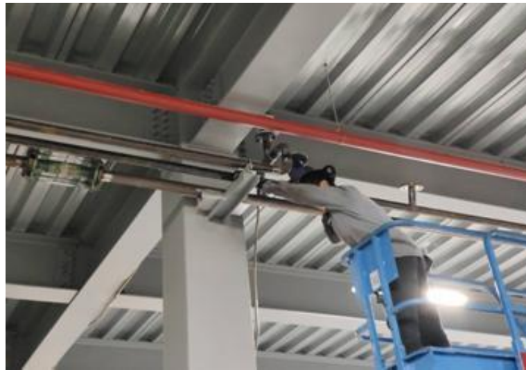
Medium-pressure steam (40Kg/cm 2 level) pipeline construction