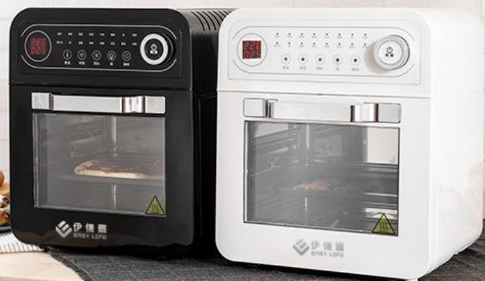
12L Air Oven