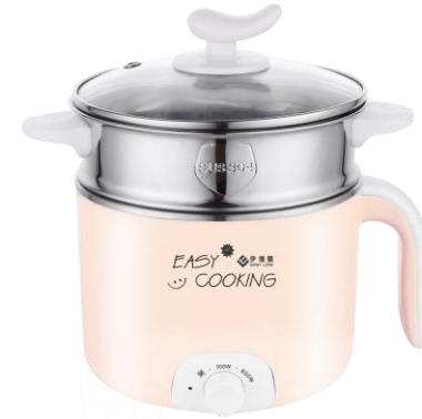
1.2L Electric Cooker Pot