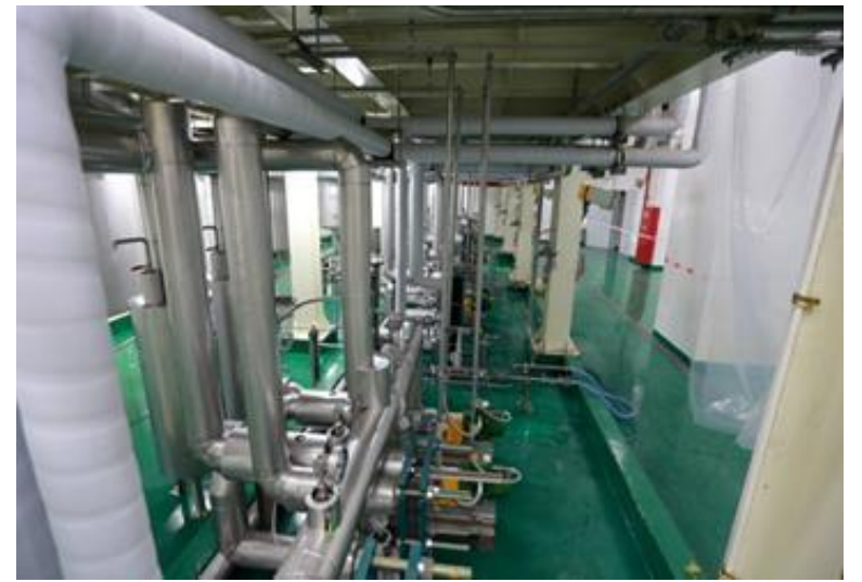
PBC Factory Glue mixing and conveying System