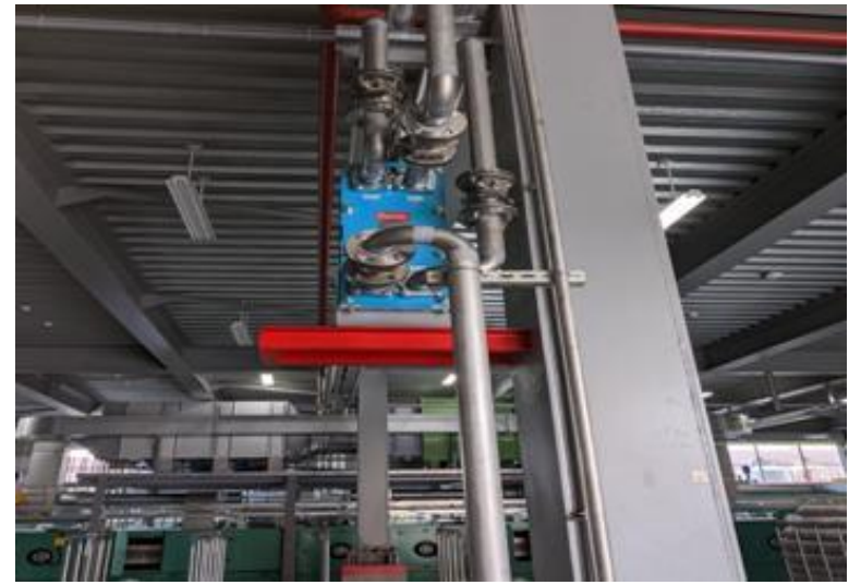
Energy-saving heat exchange equipment and piping system