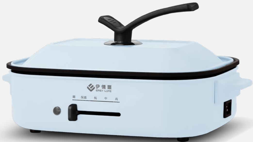
Compact Hot Plate