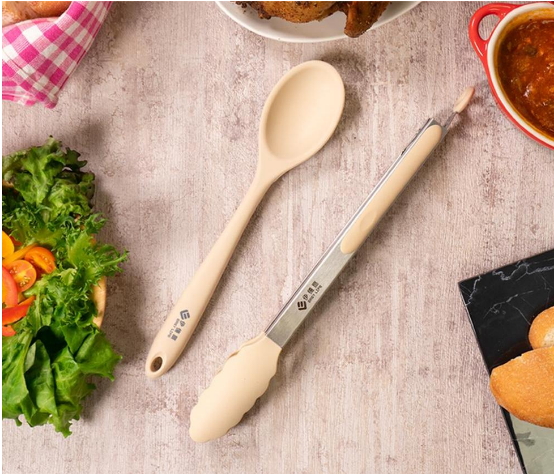
Multifunctional silicone cooking utensils set