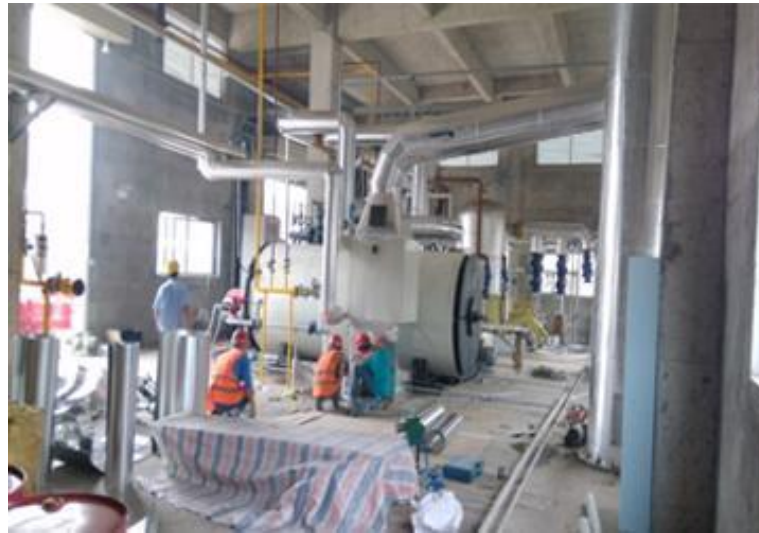
Boiler equipment installation