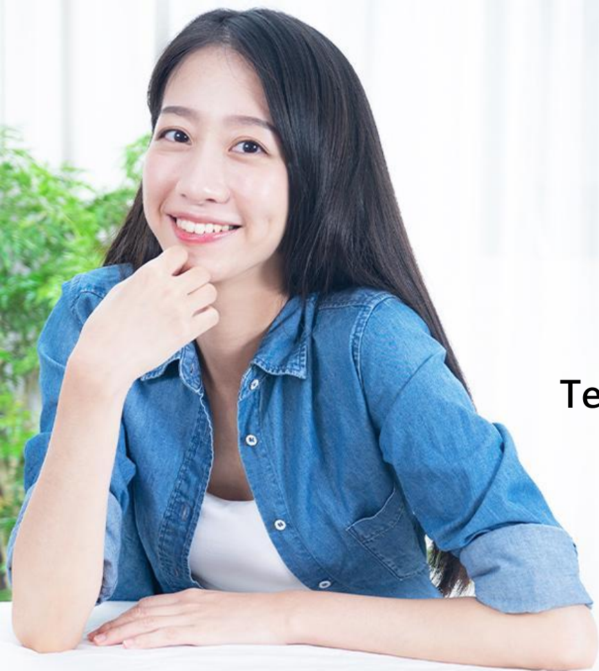
Temperature controlled mini steam iron