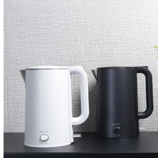
Double-layer anti-scalding and heat-preserving electric kettle