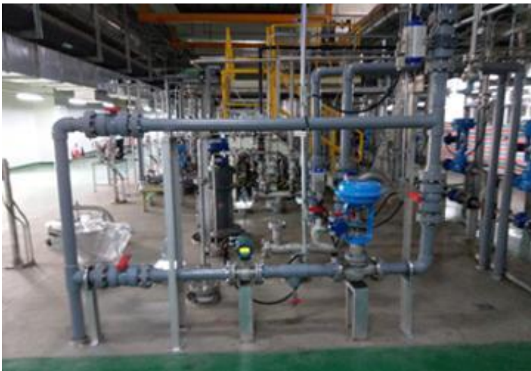
PBC Factory Secondary side piping system of glue mixing equipment