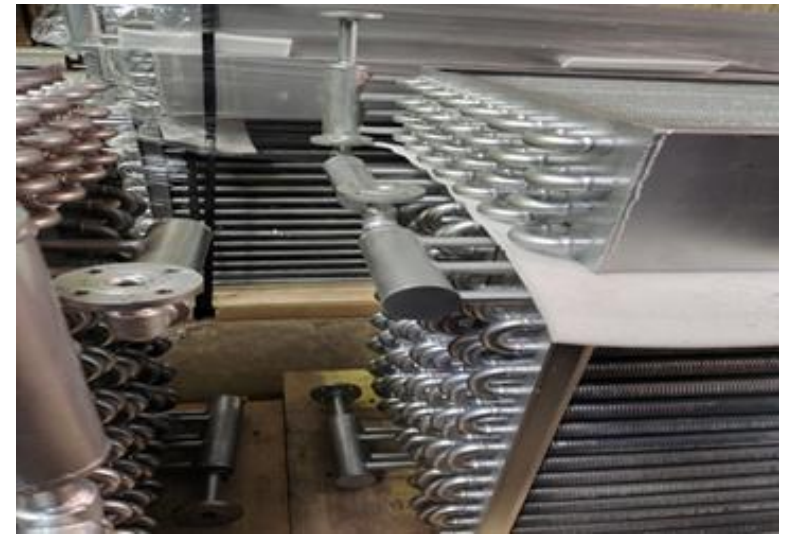
Medium pressure steam heat exchange equipment