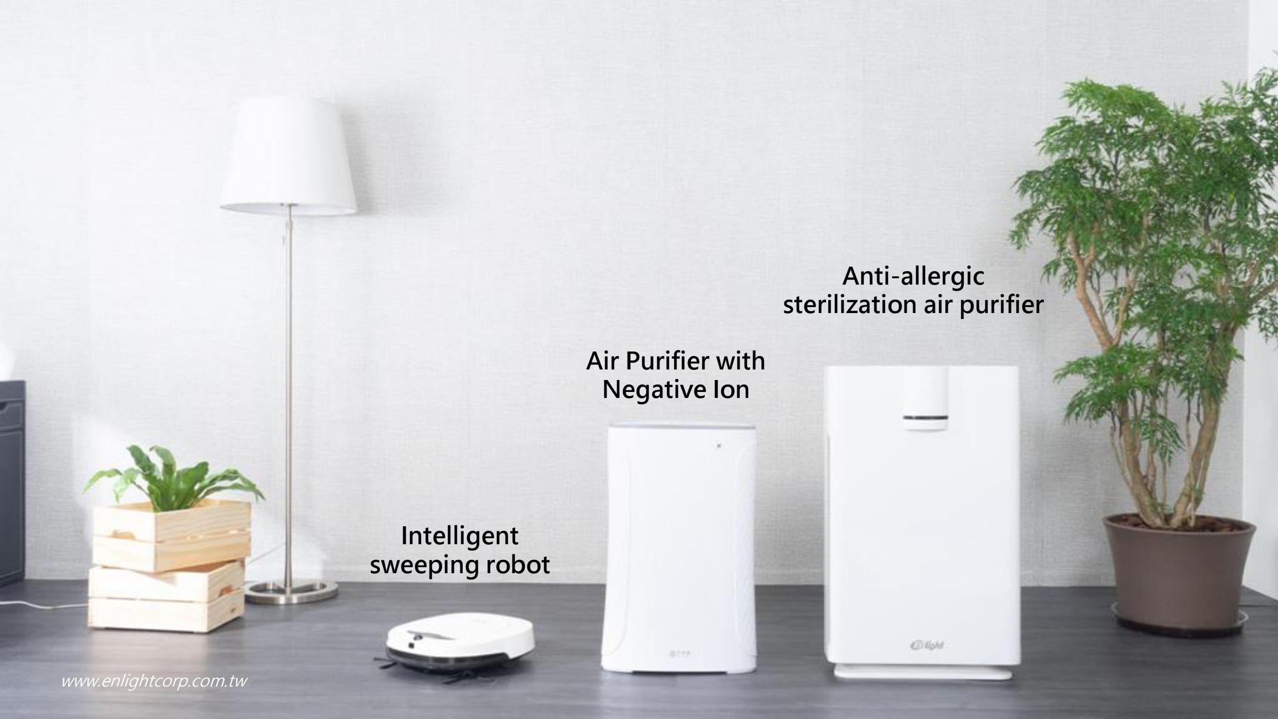
Intelligent sweeping robot