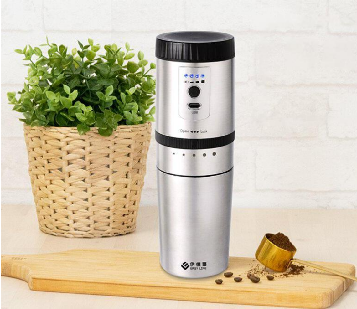
Electric grinder coffee machine