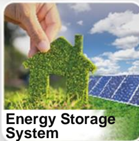
Energy Storage System