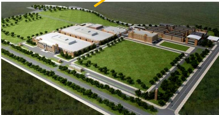
湖北- 仙桃 (2013)