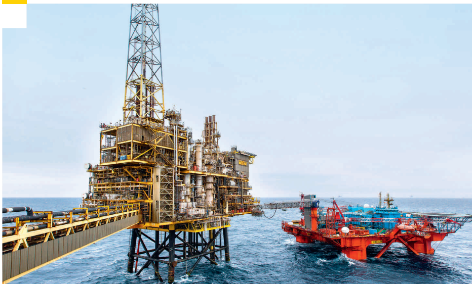
The Shearwater gas platform off the coast of Scotland in the UK North Sea.

The Directors' authority under this resolution will expire at the earlier of the close of business on August 24, 2017, and the end of the AGM of the Company to be held in 2017. The Directors have no present intention to exercise the authority sought under this resolution.