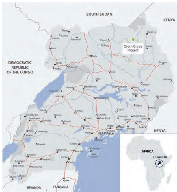
Figure 1: Location of the Orom-Cross Project

The Project is located approximately 6 km east (in a straight line) of the town of Orom and 75 km northeast of the town of Kitgum in northern Uganda (Figure 5-1). The Project can be accessed from the southwest via 104km of tarred road from Gulu to Kitgum (Orom-Koputh road) and thereafter by 87km of good quality gravel roads. Under a UK government led initiative this gravel road leading past the Orom-Cross mine site will be tarred over the next two years thus providing better access. This will assist with poor weather conditions which may increase in severity and frequency due to climate change. The nearest large settlement to the Project is the village of Orom, located in Chua East Country. Aside from road access other available key infrastructure at or near to site includes water (bores), energy (hydro-power off national grid) and cellphone coverage (communications).