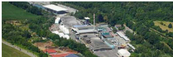
STOCKACH ALUMINIUM Germany