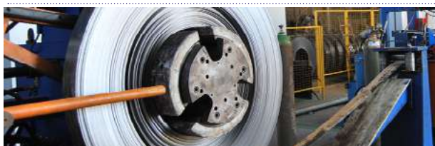
NIKOLAIDIS TH. BROS Greece