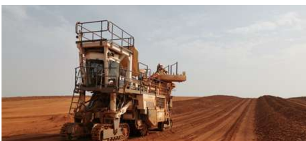
SOCIÉTÉ DES BAUXITES DE GUINÉE Republic of Guinea

Our raw materials business unit is currently focused on the development of our bauxite asset in the Republic of Guinea.