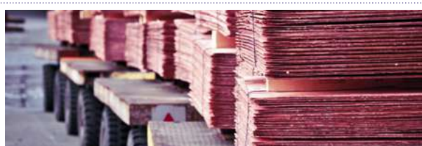
TENNANT METALS GROUP Monaco, Australia, South Africa, Luxembourg.