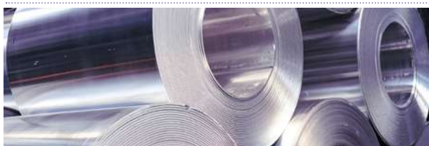
STEELCOM GROUP Luxembourg (HQ), Monaco, Germany, Austria, USA, Brazil, China, UAE, Spain, Serbia, and Switzerland.