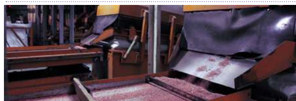
CABLE RECYCLING INDUSTRIES Spain