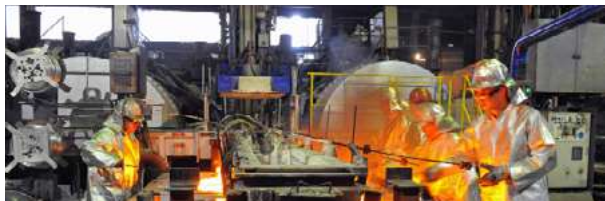
BAGR BERLINER ALUMINIUMWERK Germany

We are a leading European, independent producer of alloyed slabs. Production is based on the environmentally friendly recycling of aluminium scrap.