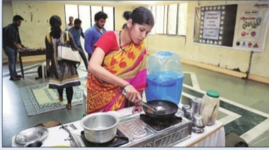
सिडनहम महाविद्यालयाच्या 'निर्वासित' या एकांकिकेमधील एक क्षण.