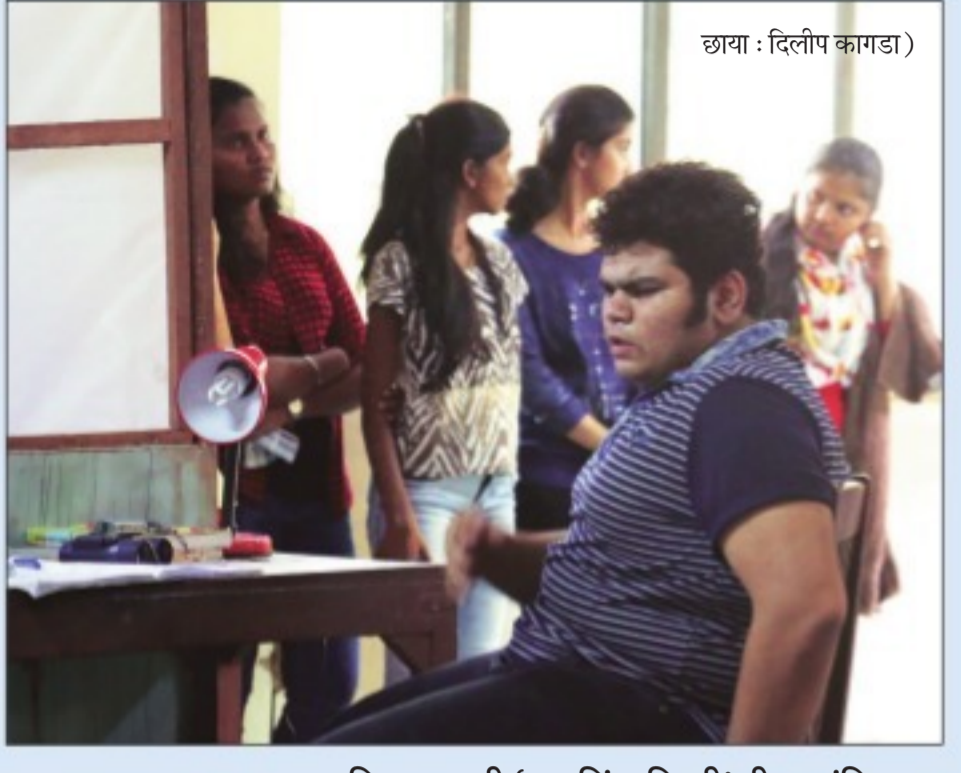
एम. एल. डहाणूकर महाविद्यालयाची 'समर्थिंग फिशी' ही एकांकिका सादर करताना महाविद्यालयाचा विद्यार्थी.

'सॉफ्ट कॉर्नर' प्रस्तुत 'ही युवा' आणि 'केसरी दुर्स', 'पितांबर' सहप्रयोजित 'लोकसत्ता लोकांकिका' स्पर्धेचे चौथे पर्व सुरू झाले असून 'अस्तित्व'च्या