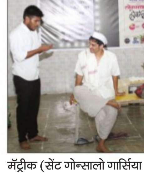
ठाणे विभागातील प्राथमिक फेरीचा निकाल

६ या स्पर्धेचे नियोजन उत्तम असते. याशिवाय नवोदित कलाकरांना एक व्यासपीठ उपलब्ध होते. या स्पर्धेत सहभागी होण्याचे हे दुसरे वर्ष आहे. आमची एकांकिका विभागीय अंतिम फेरीसाठी निवडण्यात आली आहे. त्यामुळे आमही जोरदार तयारी करणार आहे.