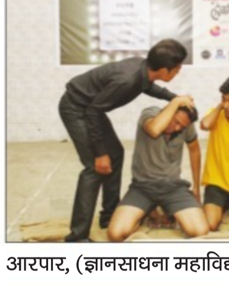
आरपार, (ज्ञानसाधना महाविद्यालय)

उत्कृष्ट सादरीकरणासाठी तरुण कलाकारांची शोबट्या सुरु असलेली धडपड, संवादाची आळवणी, नेपथ्याची जुळवाजुळव करत रंगभूमीला केलेले नम्र अभिवादन असे चित्र लोकसत्ता लोकांकिका स्पर्धेच्या ठाणे विभागाच्या प्राथमिक फेरीत पाहायला मिळाले. सोप्या भाषेत मांडलेल्या सहज सादरीकरणाने महाविद्यालयीन तरुणांनी अनेक वेगवेगळे विषय उलगडले. रनिवारी सकाळपासूनच ज्ञानसाधना शाळेत वेगवेगळ्या महाविद्यालयांचे तरुण कलाकार एकांकिका सादरीकरणासाठी दाखल झाले होते. प्राथमिक फेरीसाठी प्रकाशयोजना, ध्वनी यांचे बंधन नसले तरी प्रत्येक महाविद्यालयाच्या कलाकारांनी प्रभावीपणे मांडलेल्या सादरीकरणाने एकांकिकेतील भूमिका उपस्थितांचे लक्ष वेधून घेत होत्या.