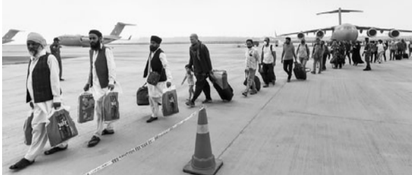
People from Afghanistan arrive in an IAF special flight at the Hindon Air Force Station.

India on Sunday brought back 392 people, including two Afghan lawmakers, in three different flights as part of the mission to evacuate its nationals and Afghan partners from Kabul in the backdrop of increasing hostilities by the Taliban and deteriorating security situation in the city, after it fell to the militant outfit a week back.