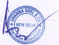
( VISHNU P.DAS )