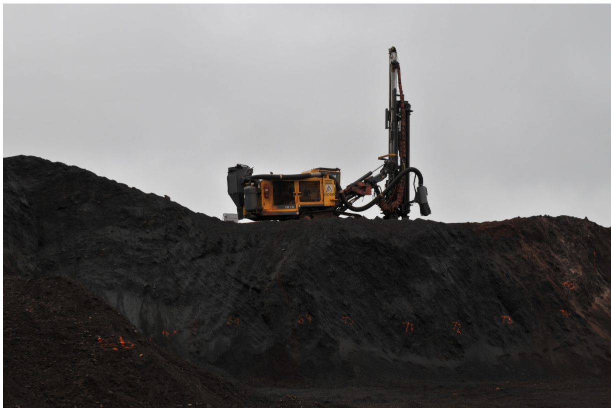
Above: Blast hole drilling rig above exposed dark hematite ore face at the James Pit.

Front cover: Aerial view of the Silveryards processing and loading area, with ore stockpiles and railcars ready for departure.