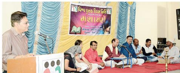
મુંદરામાં વિશ્વ પુસ્તક દિનની ઉજવણી પ્રસંગે ઉપસ્થિત સાહિત્યપ્રેમીઓ.

પશ્ચિમ કચ્છના ગામડાની શેરીઓ દીપી ઊઠી : સહલીઓના મિલનથી સંસ્કૃતિના દર્શન સગાવહાલાની મહેમાનગતી કરવા ઠેર-ઠેર ઈજન પાકવામાં આવ્યા છે. જેના કારણે રસોઈયાની માંસમ ખીલી ઊઠી છે. છૂટક રસોઈયાની અત્યારે બોલાવાયા છે. પરદેશીના આગમનથી ખાણી-પીણીની બજારમાં તેજ આવી છે, કચ્છી દાબેલી, વાડાપાંઉ, બટાટાવડા, કચ્છી ભેળ હું, વગર પેડાની ડુકાનો ઉપર પરદેશી બાબુઓની જમાવડો જોવા મળે છે. પાણીપુરીની લારીઓ ઉપર કરાવે જોવા મળે છે. અન્ય સજ્જાઓની સરખામણીમાં કચ્છમાં વાતાવરણ અત્યારે ઠંડકવાળું હોવાથી કચ્છના નાસ્તા સાથે કચ્છી હવા ખાવાની મજા ખૂબ જ હોય છે.