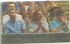
contrast to the U.S. Open, ... begin

magnified by 10 that it was a ... to block out, and, Petchey