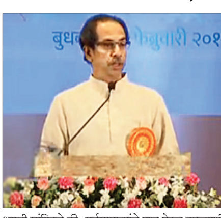
आम्ही सांगितले की, सर्वसामान्यांचे प्रश्न घेऊन तुमच्याशी लढणारी शिवसेना तेव्हाही होती आणि आताही आहे. जेव्हा सगळे तुमच्यासोबत होते तेव्हा सामान्यांचे प्रश्न घेऊन आम्ही तुमच्यासोबत उभे राहिलो. तर सगळे तुमच्या विरोधात गेले तेव्हा हिंदुत्वासाठी तुमच्यासोबत सोबत आलो असे त्यांनी सांगितले. तसेच वायुसेनेच्या वीरपुत्रांना सलाम करत त्यांच्या शौर्याचे श्रेय कोणीही घेऊ नये असे ते म्हणाले.