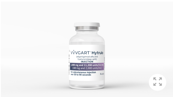
VYVGART Hytrulo Bottle

and outcome of marketing authorizations for VYVGART Hytrulo by the European Medicines Agency and Japan’s Pharmaceuticals and Medical Devices Agency. By their nature, forward-looking statements involve risks and uncertainties and readers are cautioned that any such forward-looking statements are not guarantees of future performance. argenx’s actual results may differ materially from those predicted by the forward-looking statements as a result of various important factors. A further list and description of these risks, uncertainties and other risks can be found in argenx’s U.S. Securities and Exchange Commission (SEC) filings and reports, including in argenx’s most recent annual report on Form 20-F filed with the SEC as well as subsequent filings and reports filed by argenx with the SEC. Given these uncertainties, the reader is advised not to place any undue reliance on such forward-looking statements. These forward-looking statements speak only as of the date of publication of this document. argenx undertakes no obligation publicly update or revise the information in this press release, including any forward-looking statements, except as may be required by law.